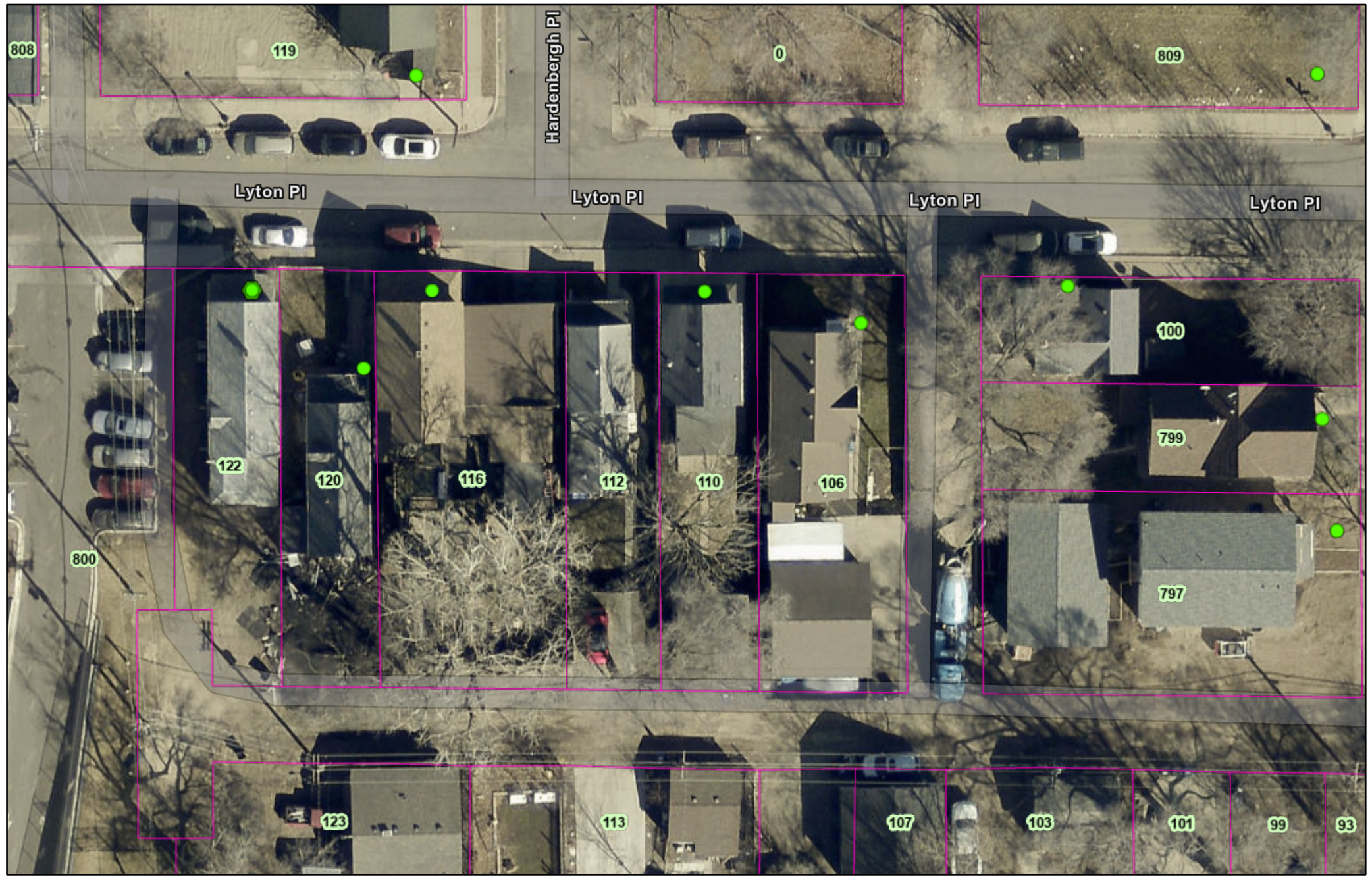
2/24/2025 1:01 PM