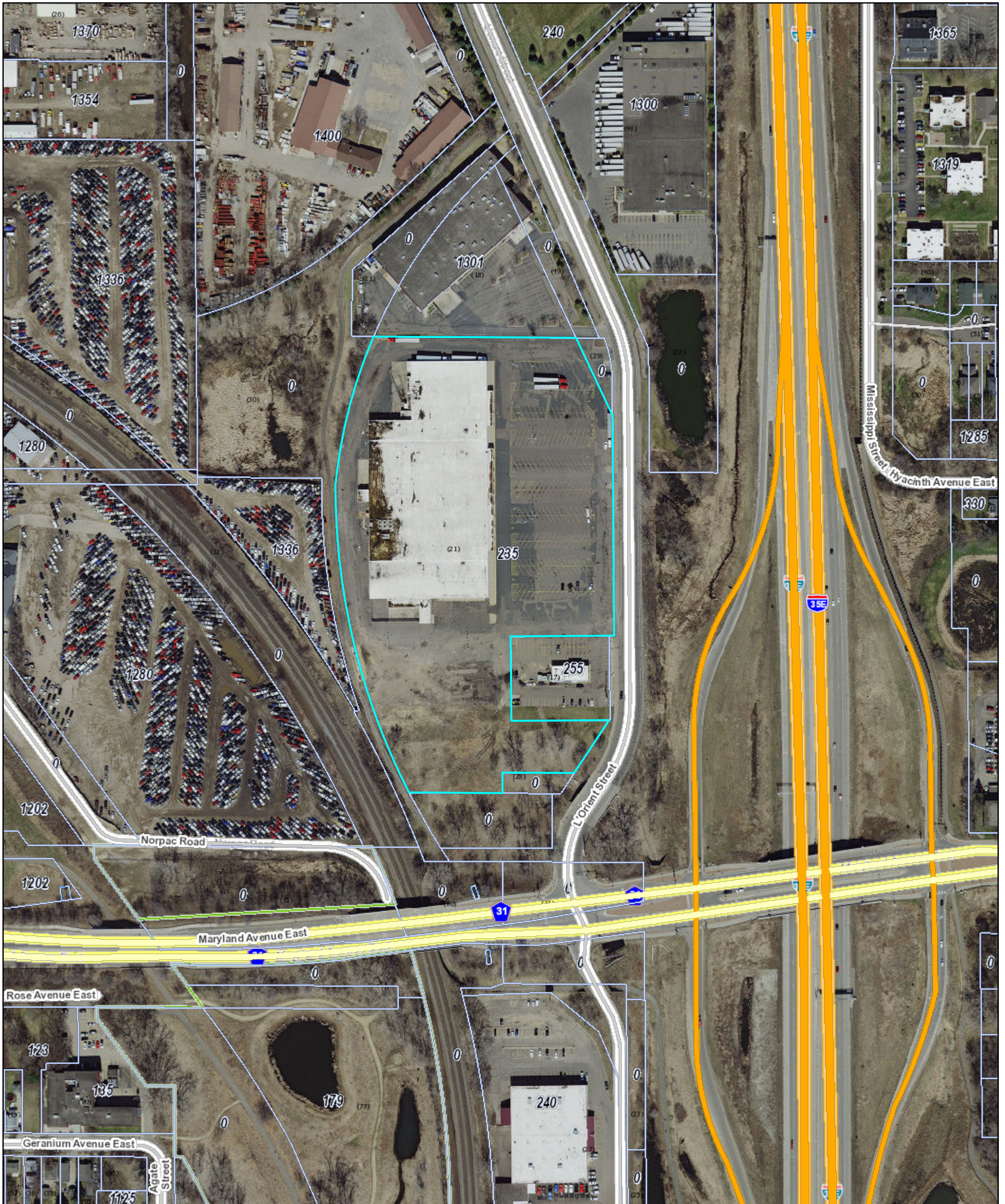
Exhibit A - Shidler "Access Property"