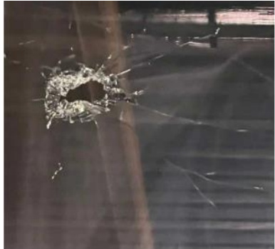
Thanks so much, Billy's on Grand, for the bullet hole on my porch from Saturday night! Billy's On Grand, Saint Paul, MN