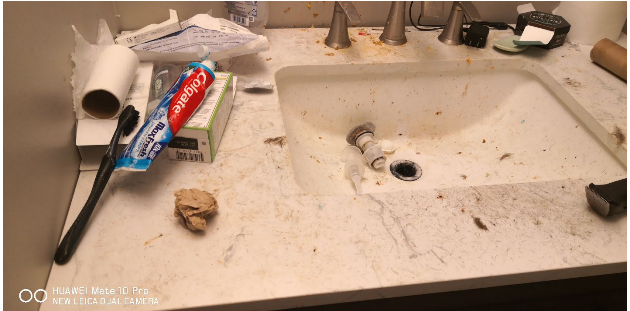
OO HUAWEI Mate 10 Pro NEW LEICA DUAL CAMERA