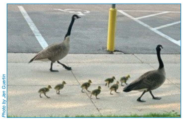
A family of Canada geese visited the administration building on May 16.