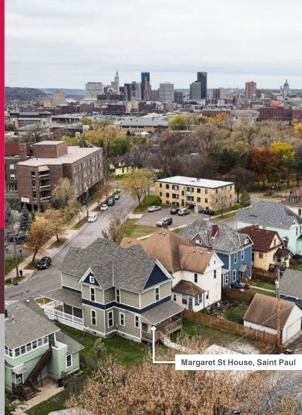
Margaret St House, Saint Paul