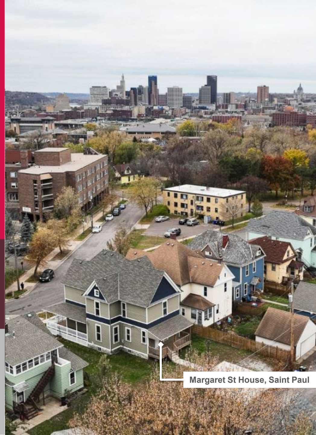
Margaret St House, Saint Paul