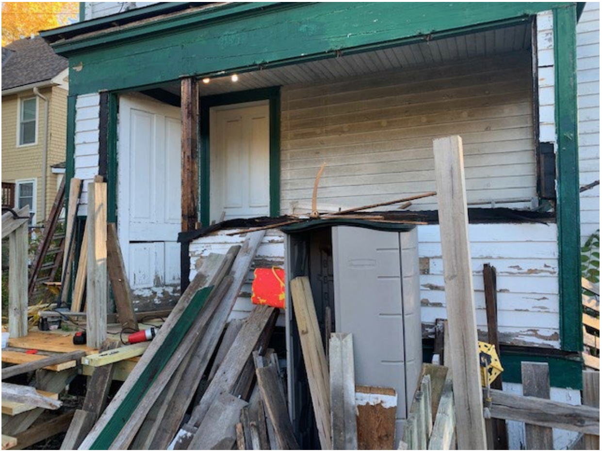
Sent from my iPhone