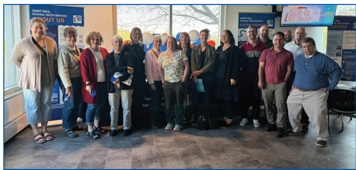
The community panel held its first meeting on May 8. They focused on the three pillars of community education, affordability, and workforce development.