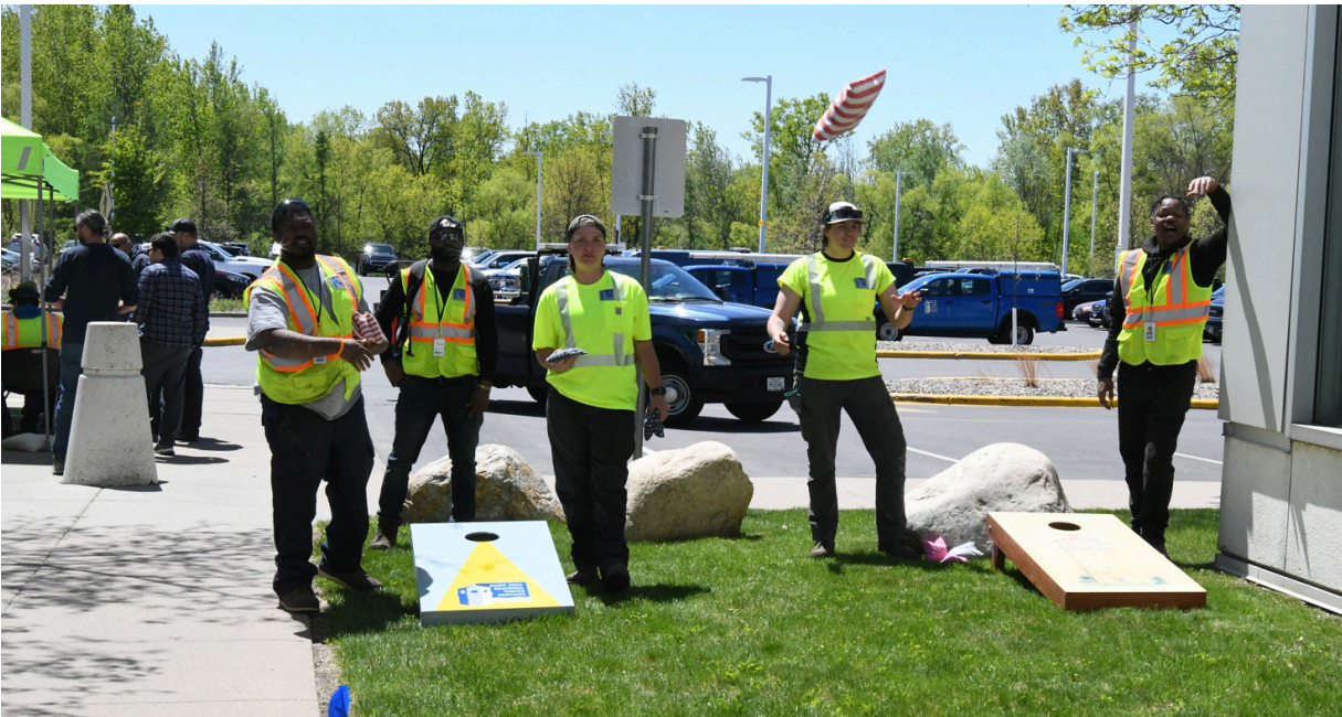
Teams compete in a friendly game of bags during the safety picnic.