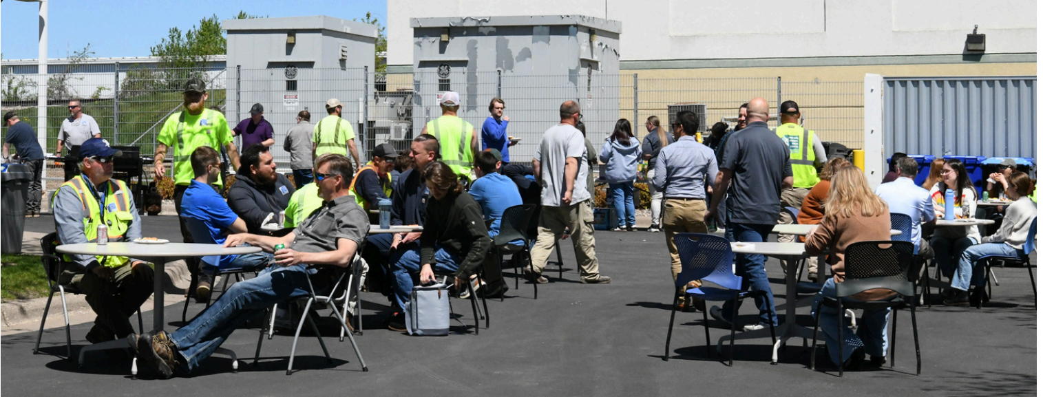
Staff gather for a meal during the spring safety picnic to kick off the construction season,