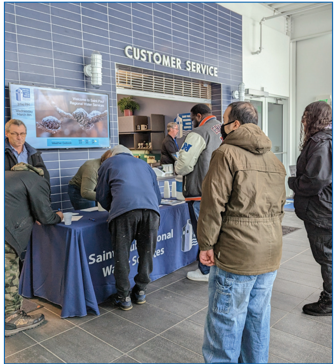
People interested in the utility trainee position lined up to sign in at the utility trainee job open house held on March 8 in the lobby of the administration building.