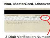
3 Digit Verification Number