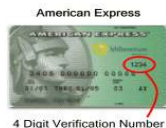
4 Digit Verification Number