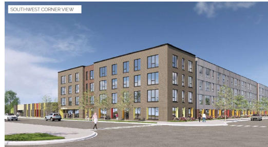
GloryVille (GloryVille, LLC)