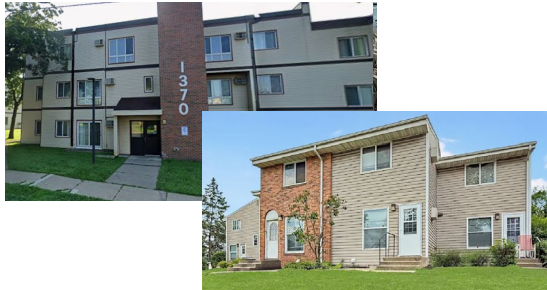
Westminster/Vista (CommonBond Communities)