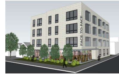
1170 Arcade Street (Face to Face Health & Counseling Services)