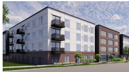
The Aragon (Beacon Interfaith)