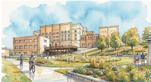
Hamm's Brewery (JB Vang Partners, Inc.)