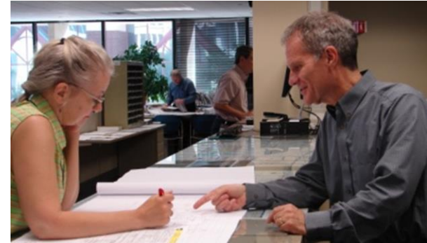
DSI Project Facilitators