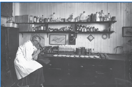
An undated photo shows the lab in the original McCarrons Treatment Plant from the late 1800s. This image is part of research being done to make a coffee table photo book of the plant prior to the changes taking place with the new plant updates at McCarrons.