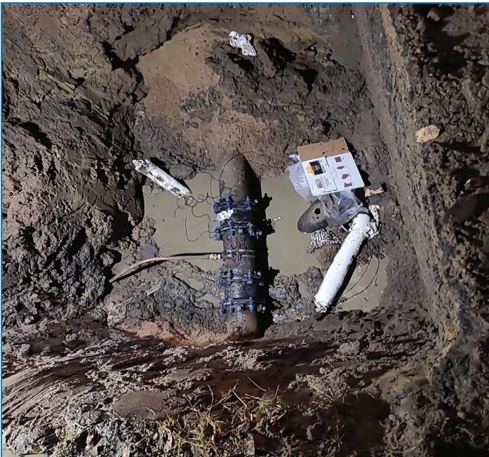
Anodes in the white 32-pound bar can be seen in this image.

1 Wikimedia Foundation. (2024, May 18). Galvanic anode . Wikipedia. https://en.wikipedia.org/wiki/Galvanic_anode Accessed 10 January 2025.