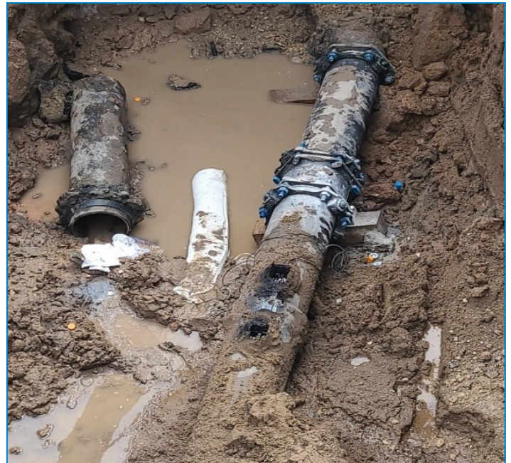
Anodes connected to the water main extend the life of the main.