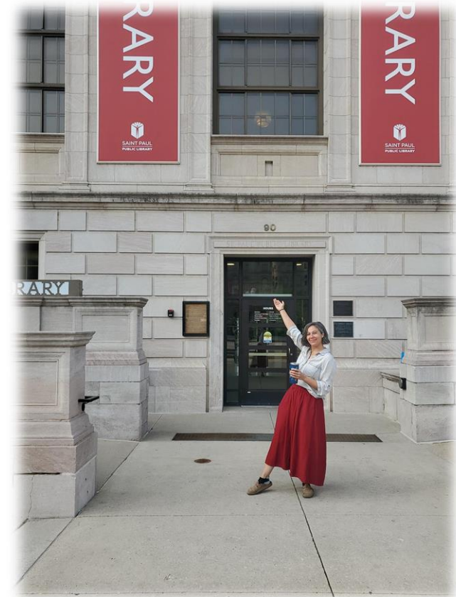
My first day with the Library!