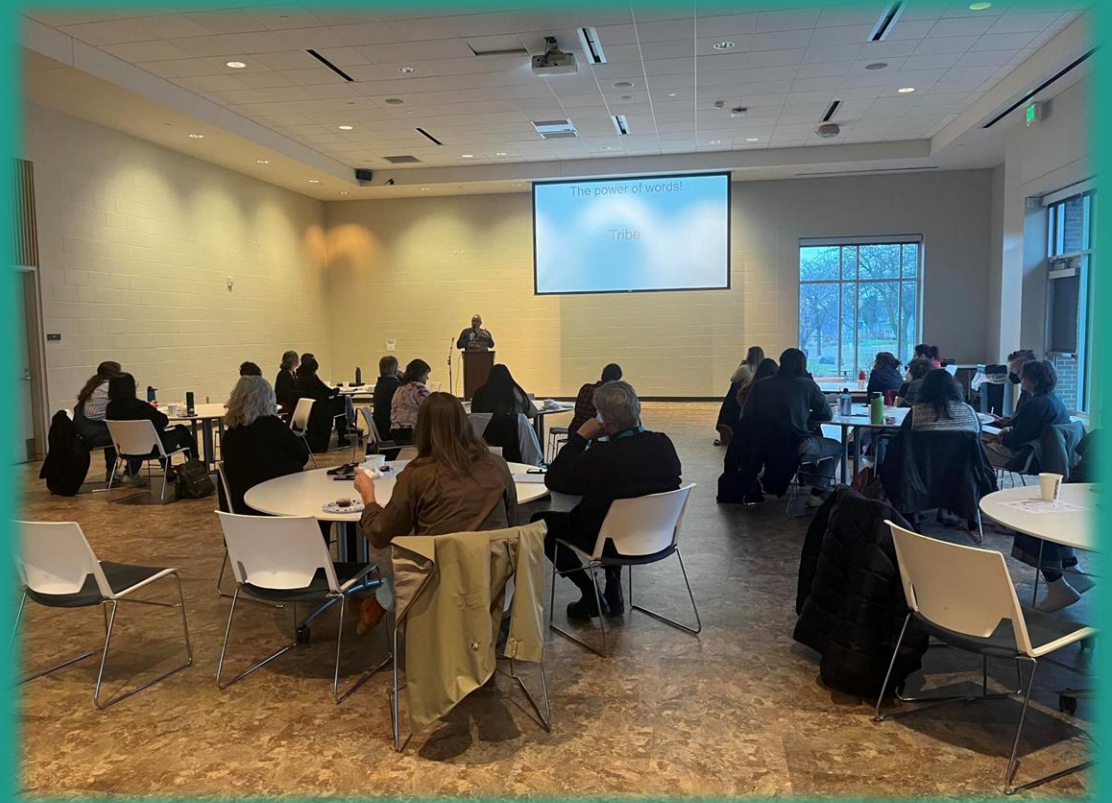
Library Staff Participating in the Native American Community Training. November 2025

"I feel like the library could do more to be a welcoming and supportive place for our Native American neighbors - some of that work rests in library staff learning more about the community so we can be responsive, relevant, and helpful."