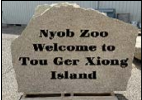
Concept of Island Marker Stone