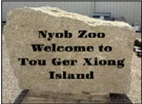
Concept of Island Marker Stone