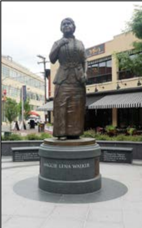
Sculpture Example: Maggie Walker