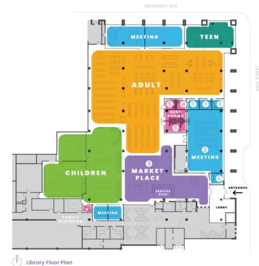
Library Floor Plan