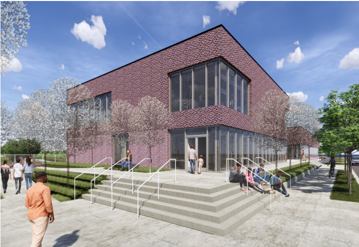
Entrance at Rice Street and Lawson Avenue