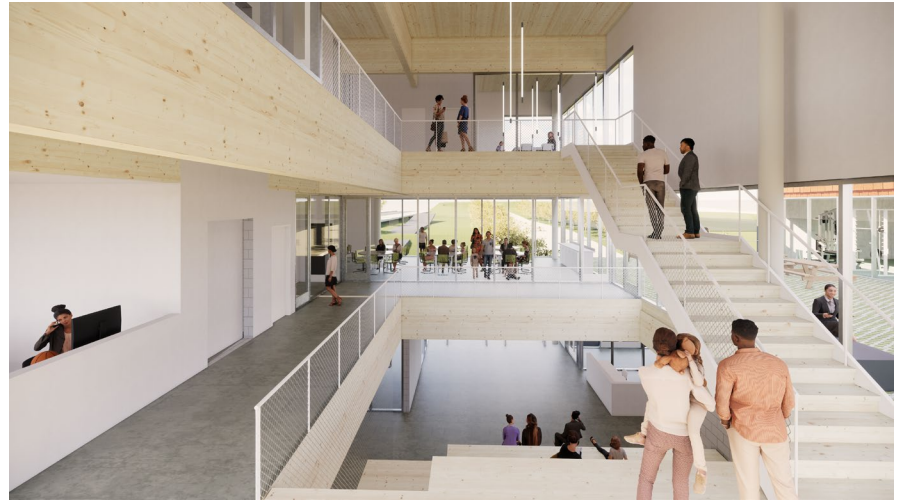
Interior "Town Hall" Community Space