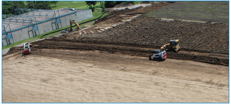
The top soil from the surface of the Highland Park south reservoir is removed by heavy equipment on June 3 as the start of demolition gets underway.

SPRWS staff will review where that project is in mid-September and make a determination as to the October open house by the end of September.