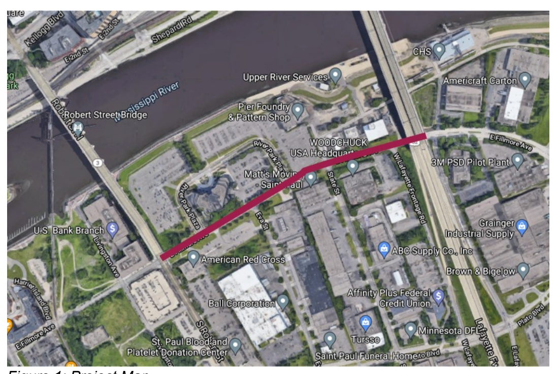
Figure 1: Project Map

The purpose of this project is to provide an improved east-west bicycle facility on Fillmore Avenue, and make purposeful connections to existing nearby bikeways, improving safety, comfort, and connectivity for people using bicycles for transportation.