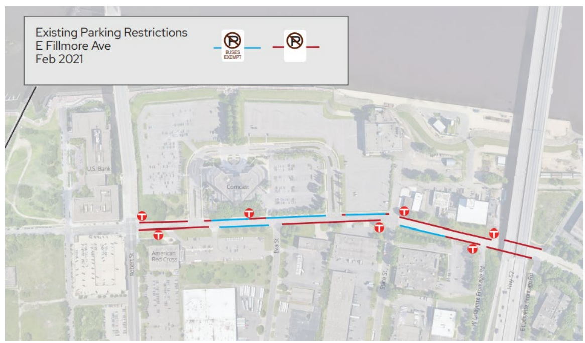
Figure 2. Existing parking regulations and transit stops

EXEMPT zones exist on State Street, south of Fillmore Avenue and West Lafayette Frontage Road, south of Fillmore Avenue.