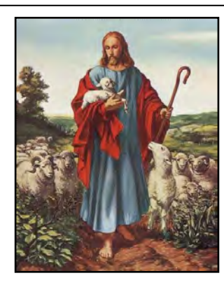
One fold and one shepherd.