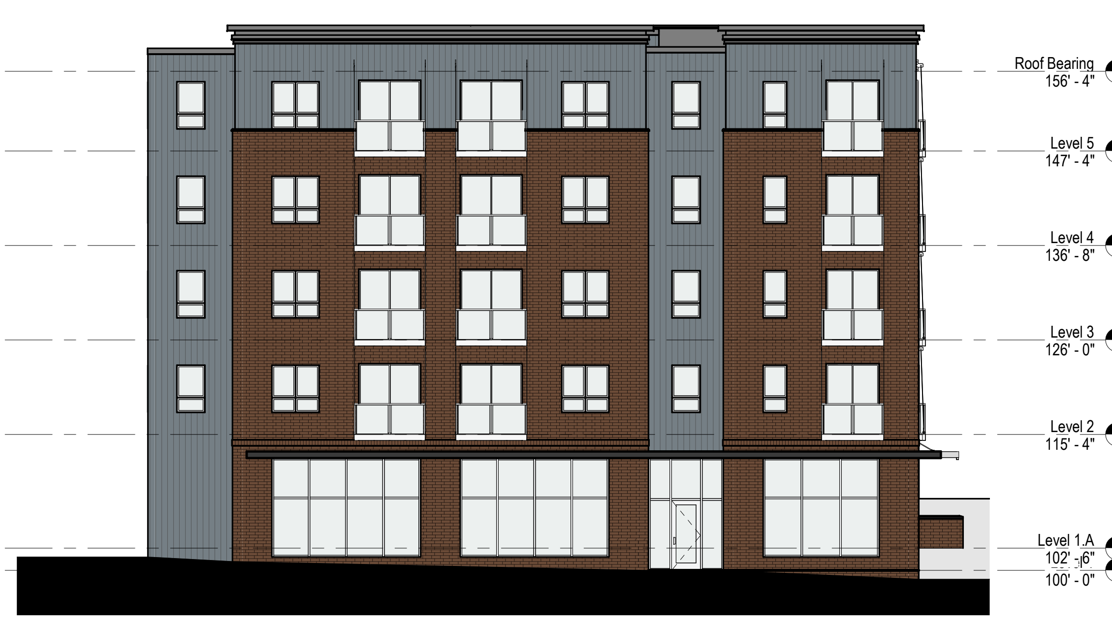
1 WEST 3/32" = 1'-0"

B:\M_360\190787 Ford Senior Housing\190787 Ford Senior Housing A20.rvt 5/22/2020 4:07:17 PM