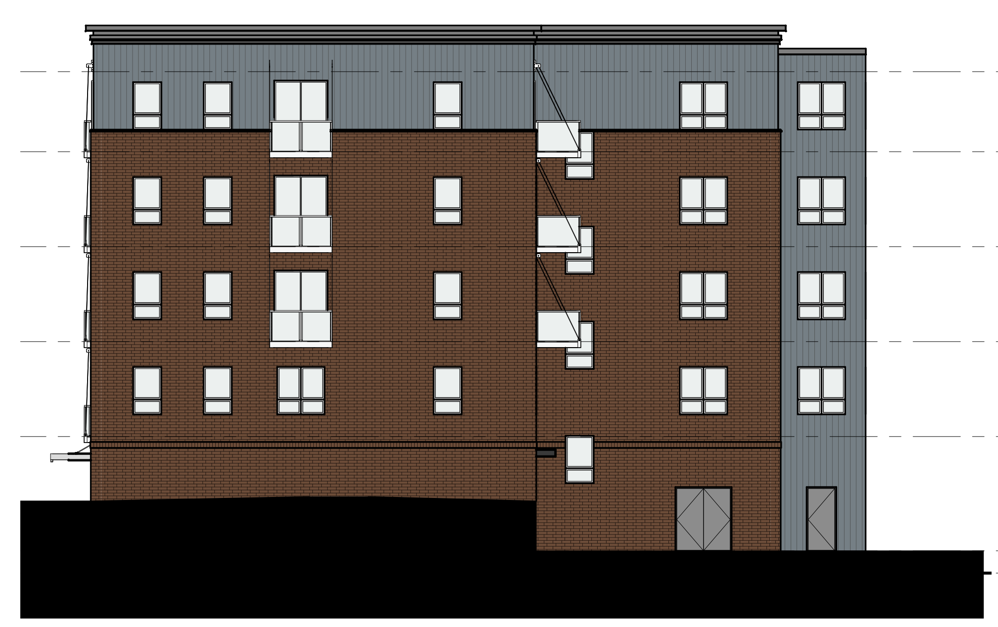
2 EAST 3/32" = 1'-0"