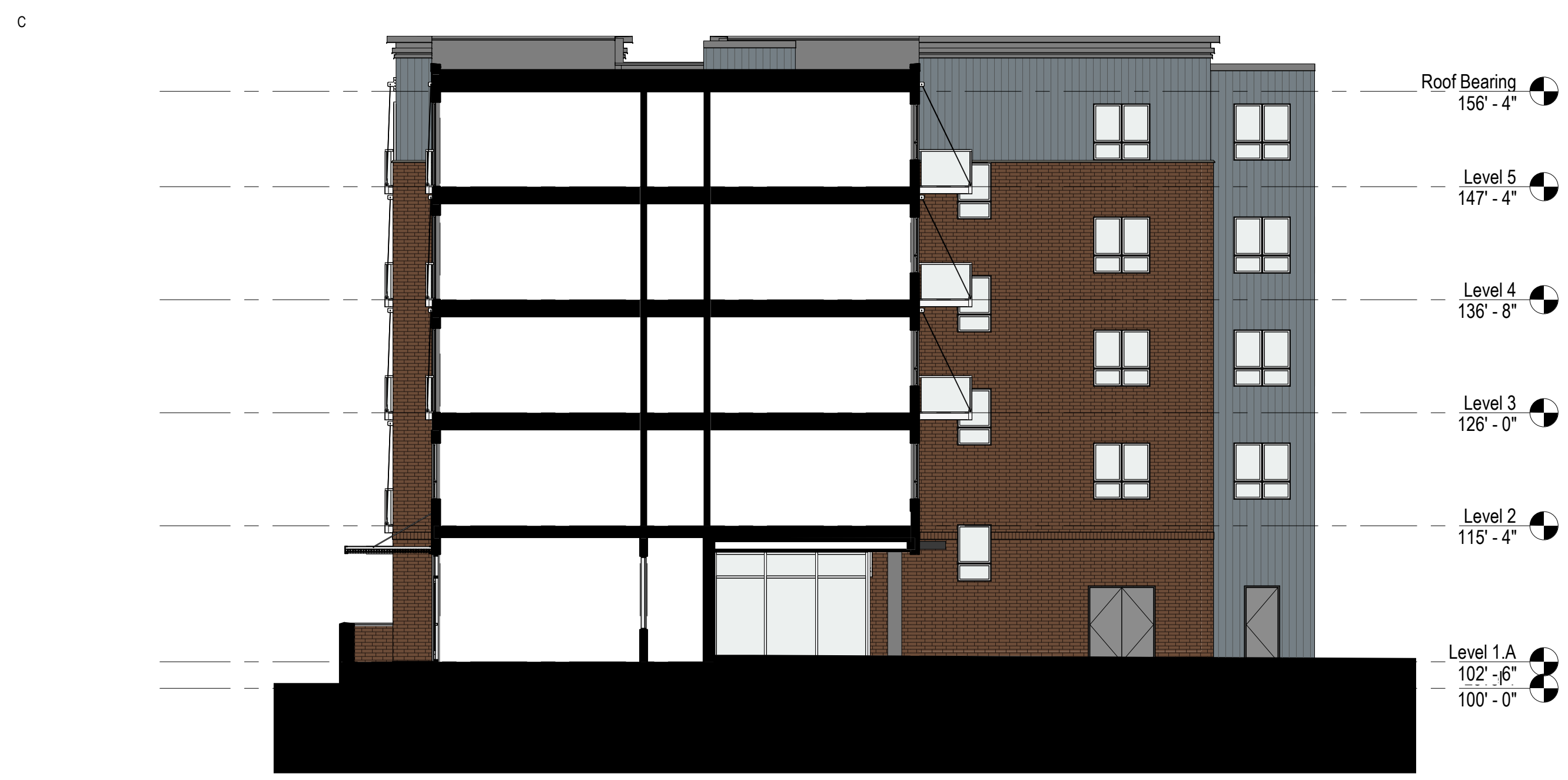
3 BUILDING SECTION 3/32" = 1'-0"