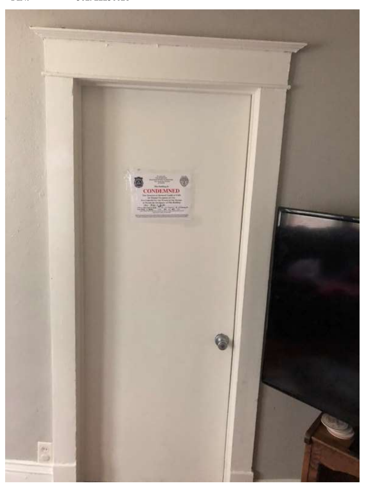
NOTE: ALL PICTURES IN THIS PHOTO DOCUMENT WERE TAKEN ON MAY 11, 2020.- EF