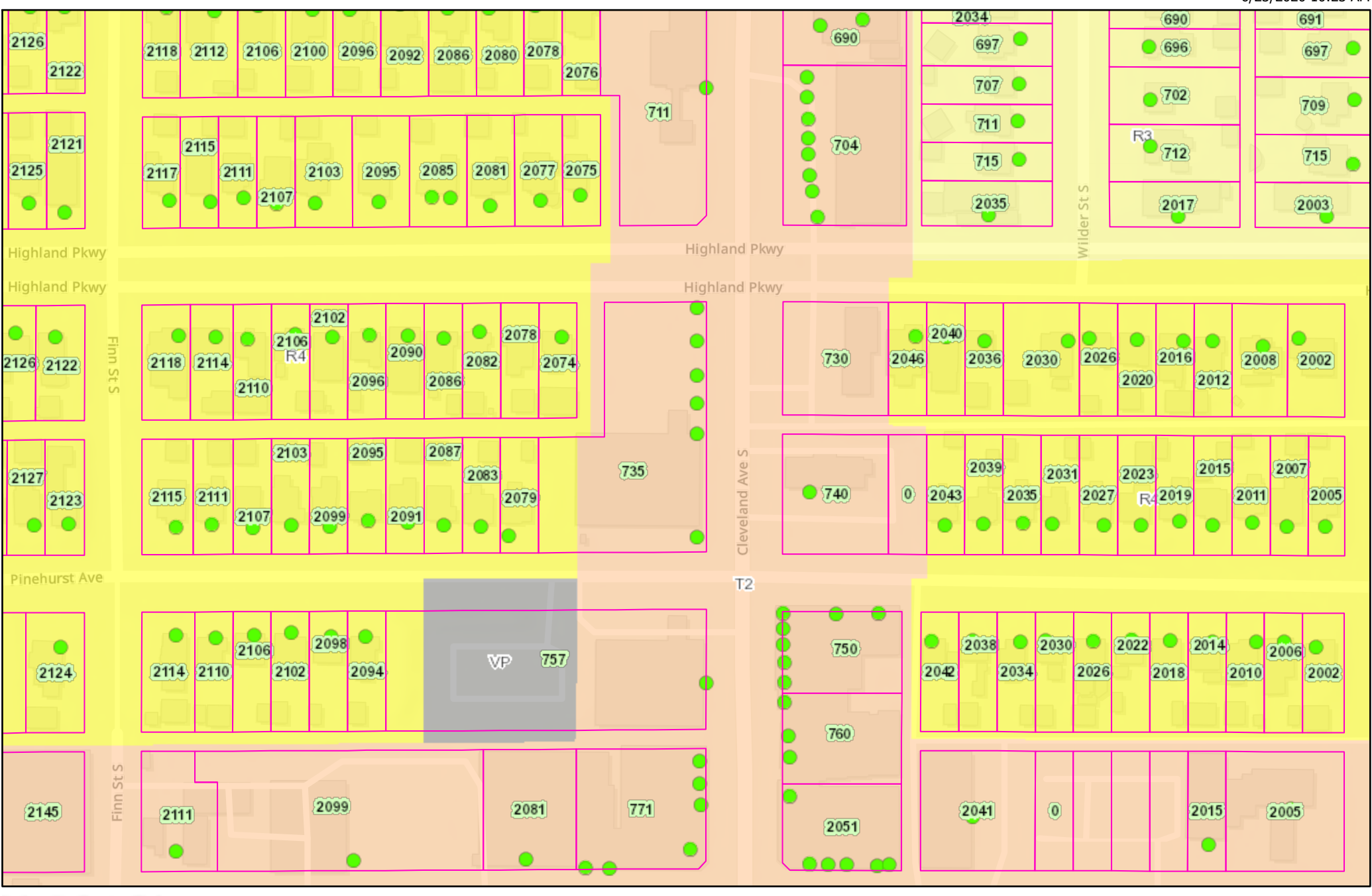
6/23/2020 10:23 AM