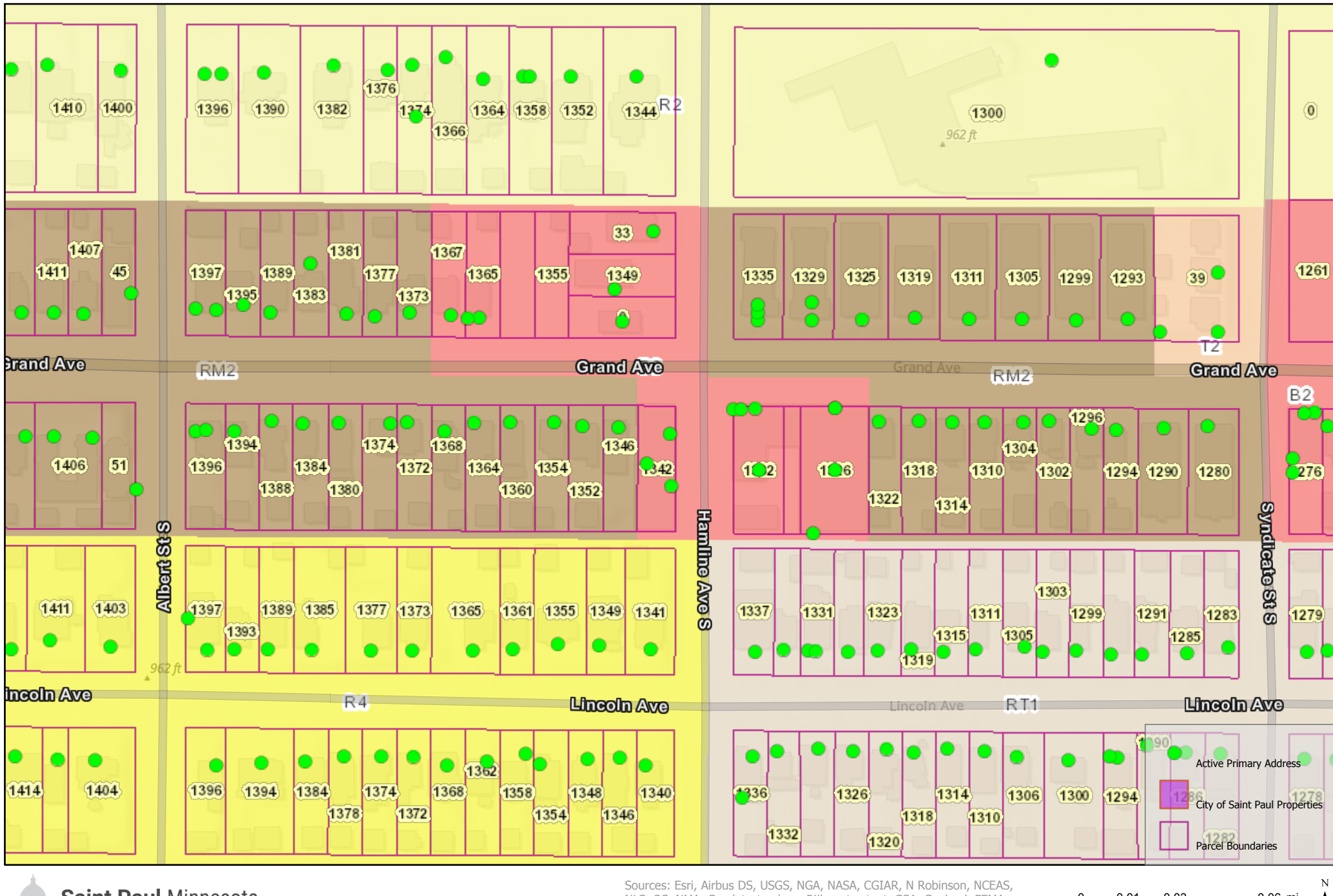
🕨 Saint Paul Minnesota