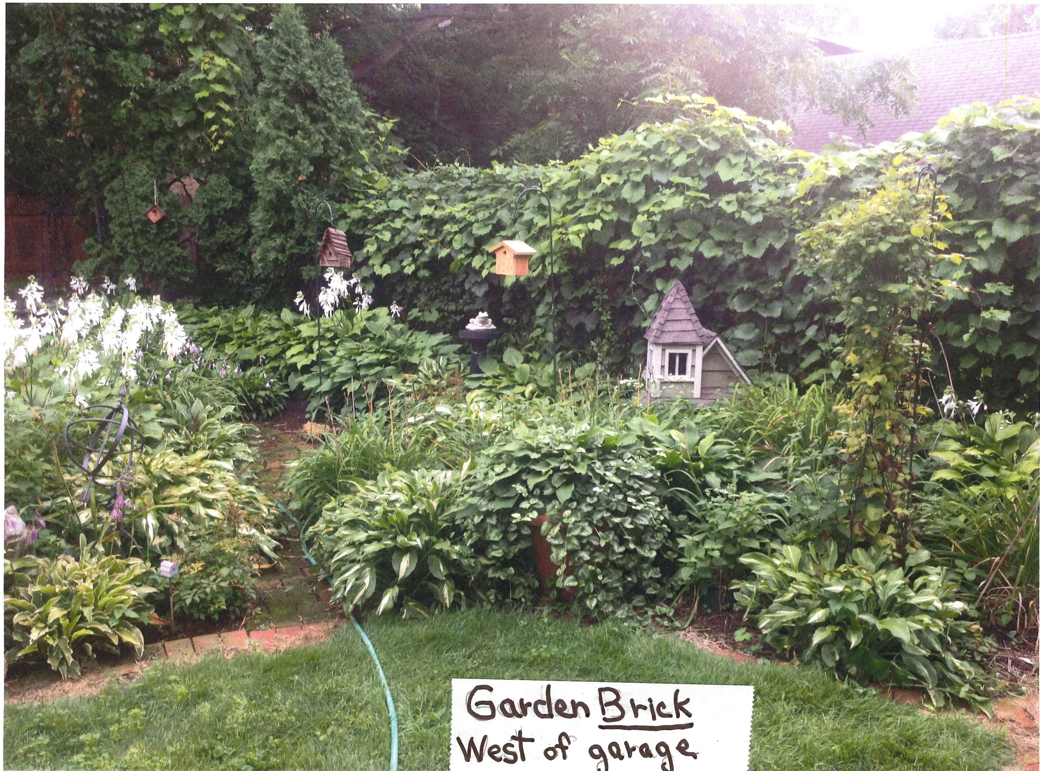
Garden Brick West of garage