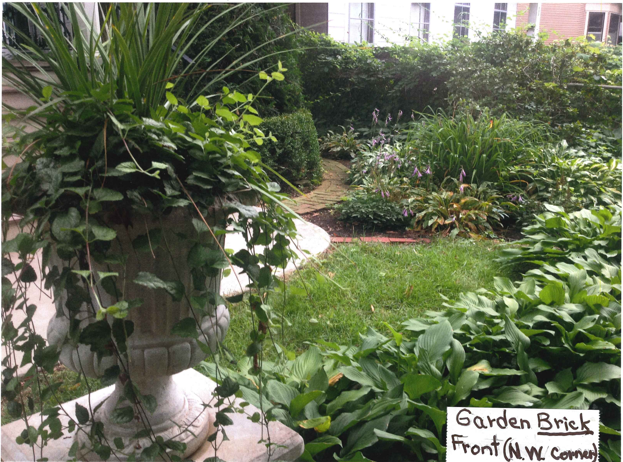
Garden Brick Front (N.W. corner)