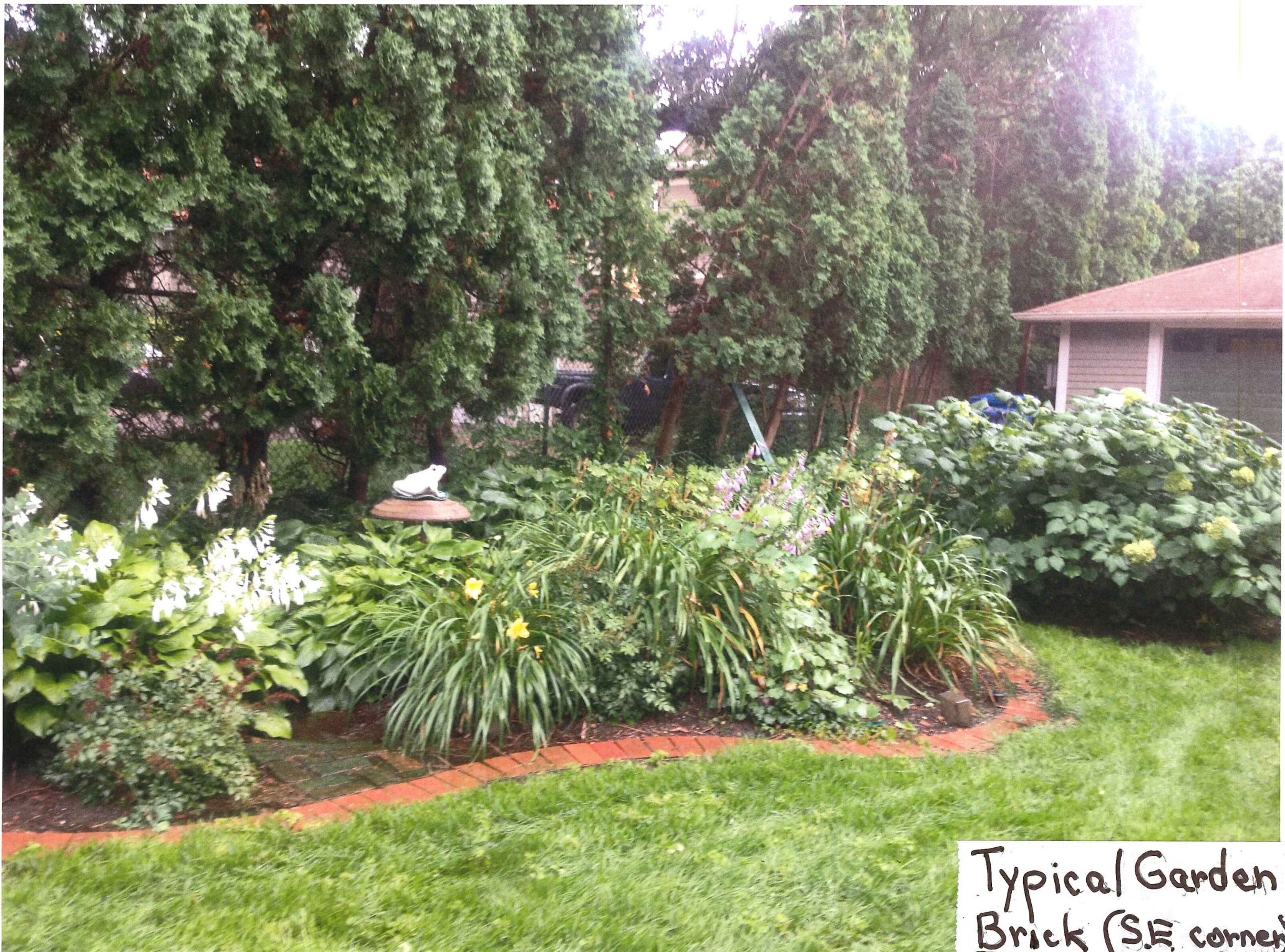
Typical Garden Brick (S.E. corner)