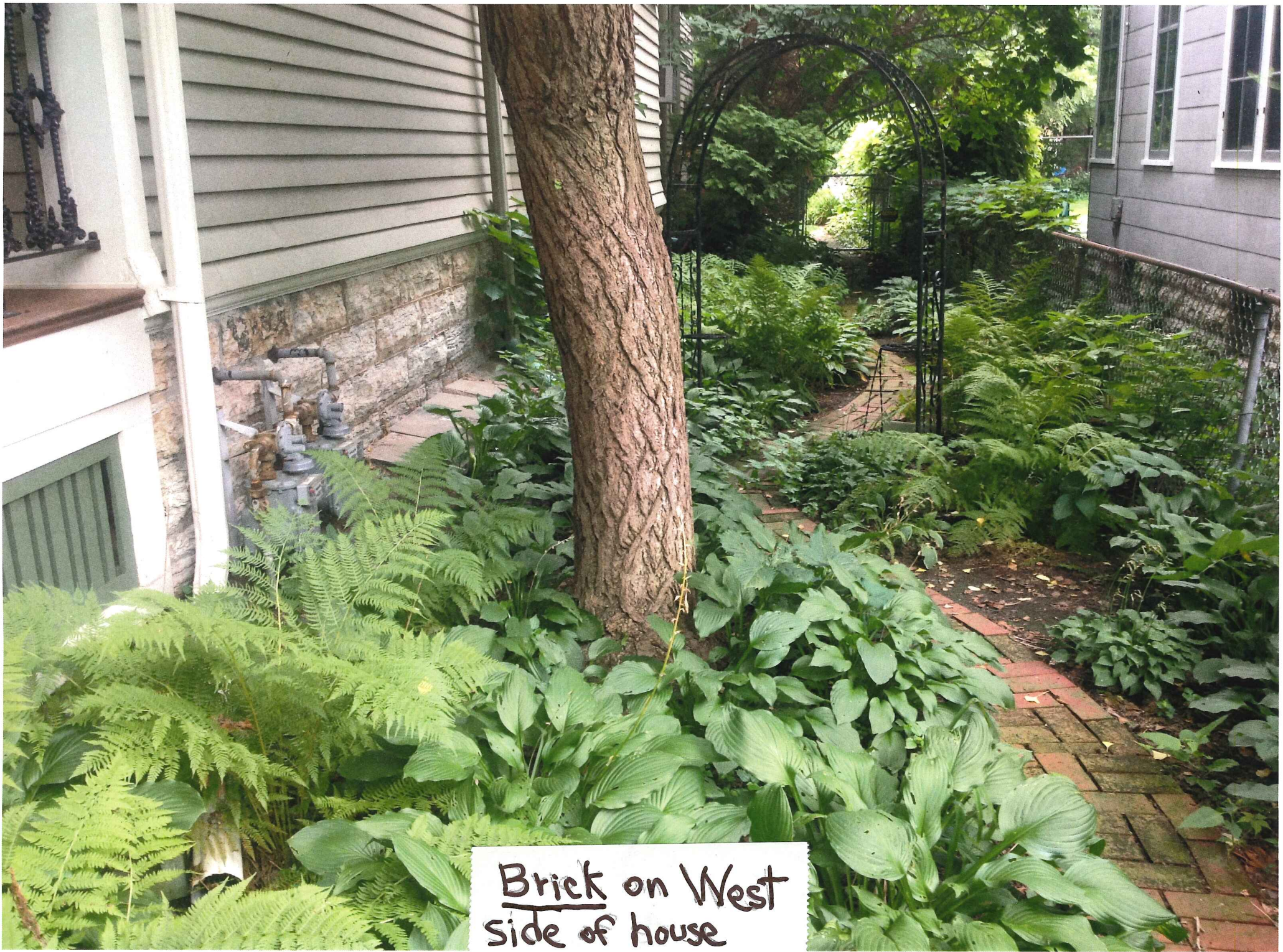
Brick on West side of house