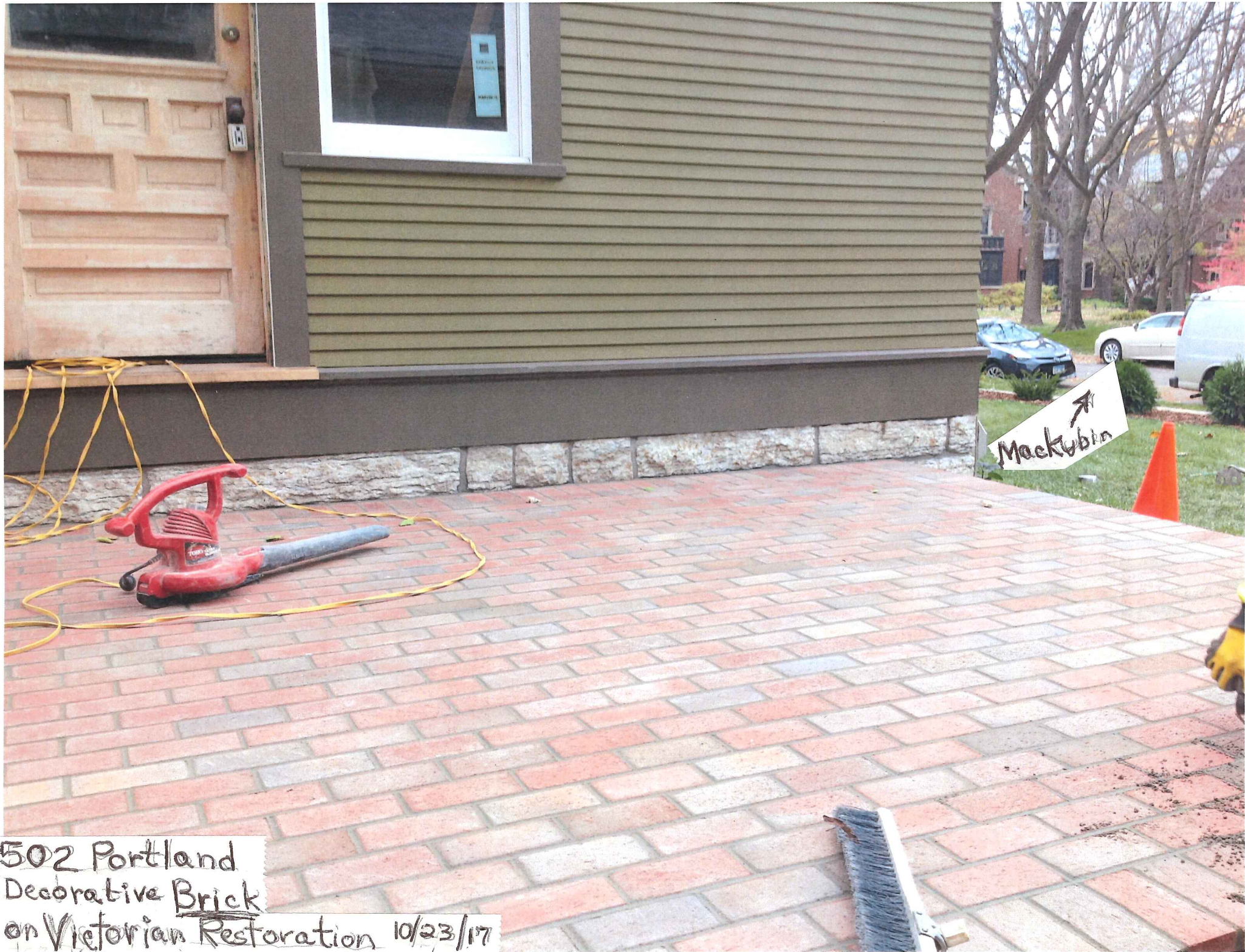
502 Portland Decorative Brick on Victorian Restoration 10/23/17