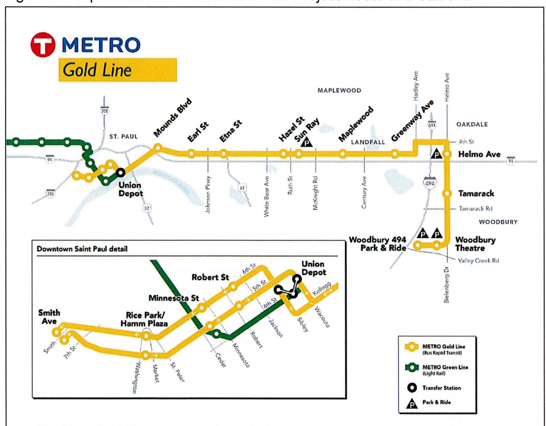
Figure 1: Proposed METRO Gold Line BRT Project Route and Stations

The METRO Gold Line Bus Rapid Transit (BRT) project is a planned 10-mile BRT transit line in Ramsey and Washington counties in the eastern part of the Twin Cities Metropolitan Area. The proposed line will travel between downtown Saint Paul and Woodbury, serving the cities of Saint Paul, Maplewood, Landfall, Oakdale, and Woodbury (See Figure 1). The route will run along local roadways generally north of and near Interstate 94 primarily within bus-only lanes (dedicated guideway) and serve 21 stations, including ten in downtown Saint Paul. The stations will have enhanced features similar to existing METRO Light Rail Transit (the Green and Blue lines) and METRO BRT (the A and C lines) service. The line is anticipated to serve and draw ridership from a broader area in the region as well, including portions of western Wisconsin, Washington County, Ramsey County, Dakota County, and Hennepin County, including the city of Minneapolis.