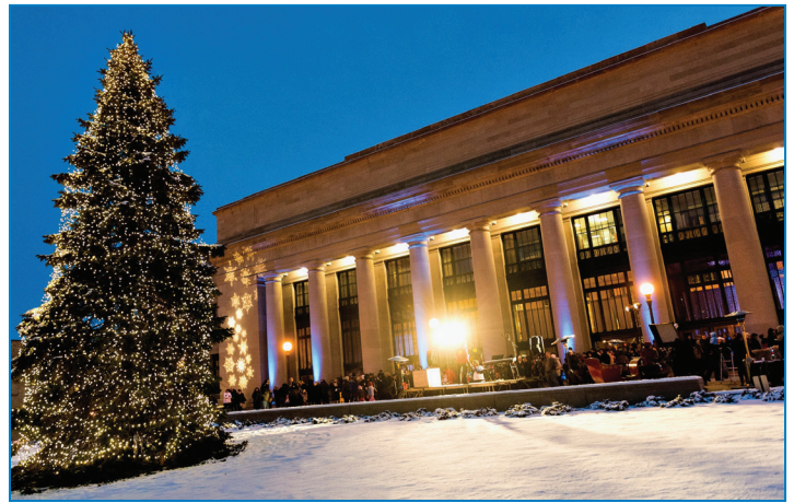
Union Depot. Tree lighting.

For a list of holiday concerts at surrounding private