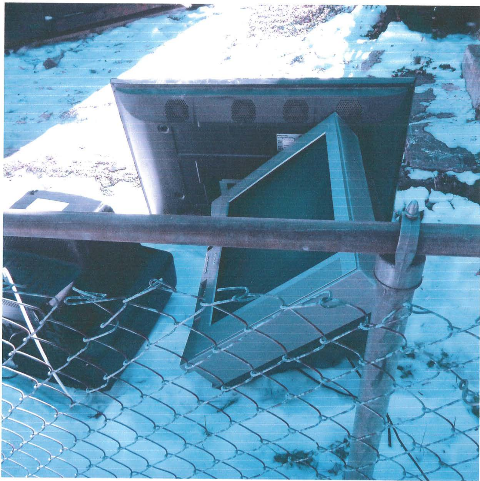
Junk piled outside at 1140 Jackson (TV's, Refrigerator) Broken chain link fence