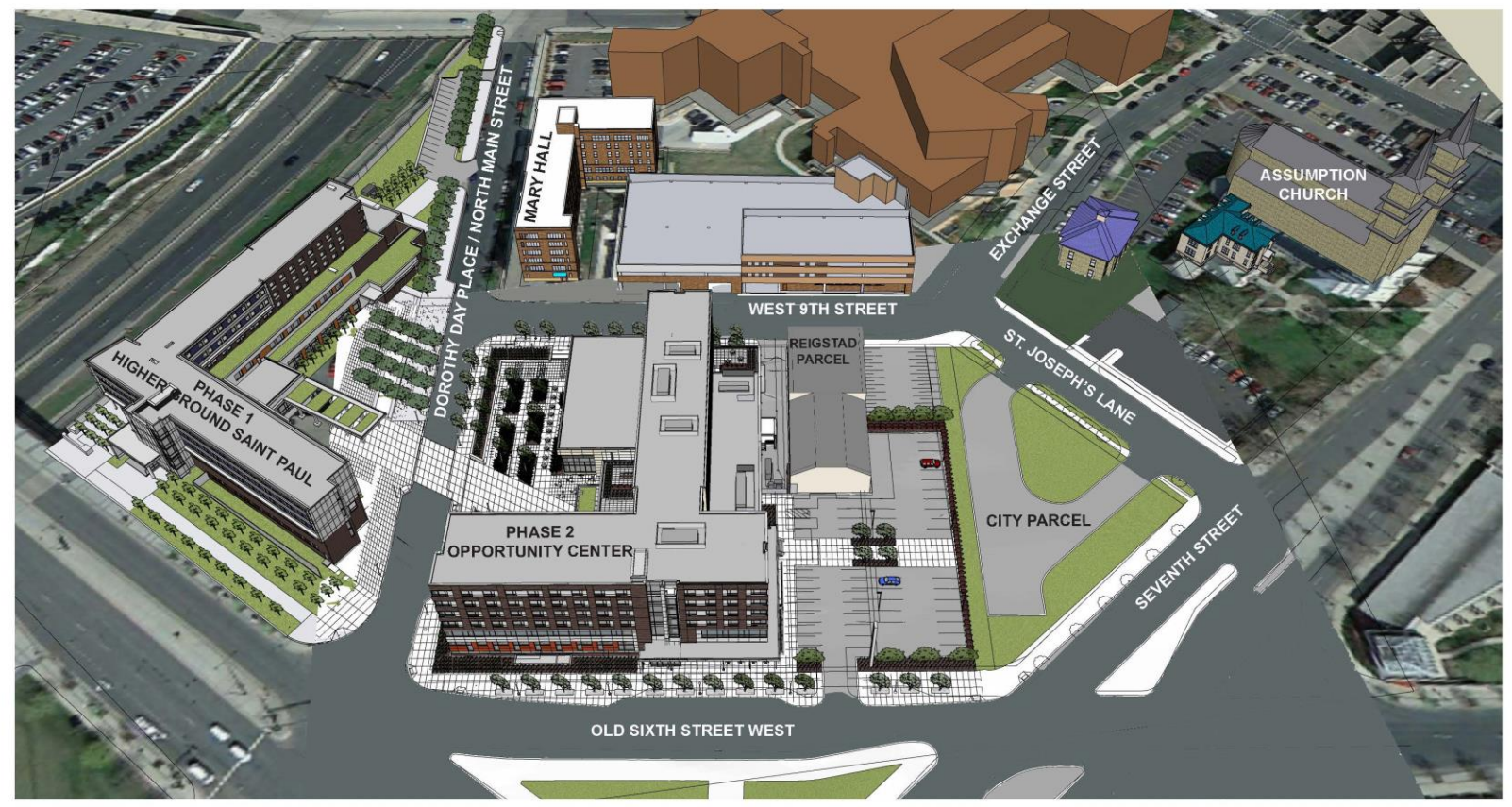
CAMPUS AERIAL VIEW

DOROTHY DAY REVISIONING Catholic Charities of Saint Paul & Minneapolis 1 February 2019