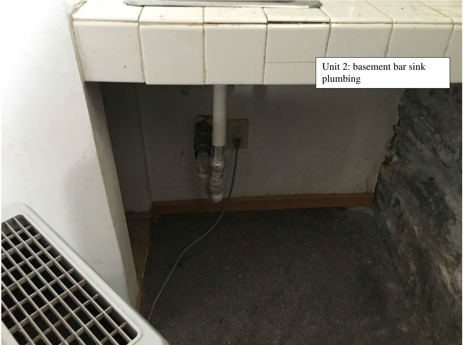
Unit 2: basement bar sink plumbing

Date: April 25, 2019 File #: 17 - 217860 Folder Name: 705 SUMMIT AVE PIN: 022823140181