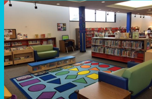
Before (right) and after (left): Play and Learn space at the Hayden Heights library