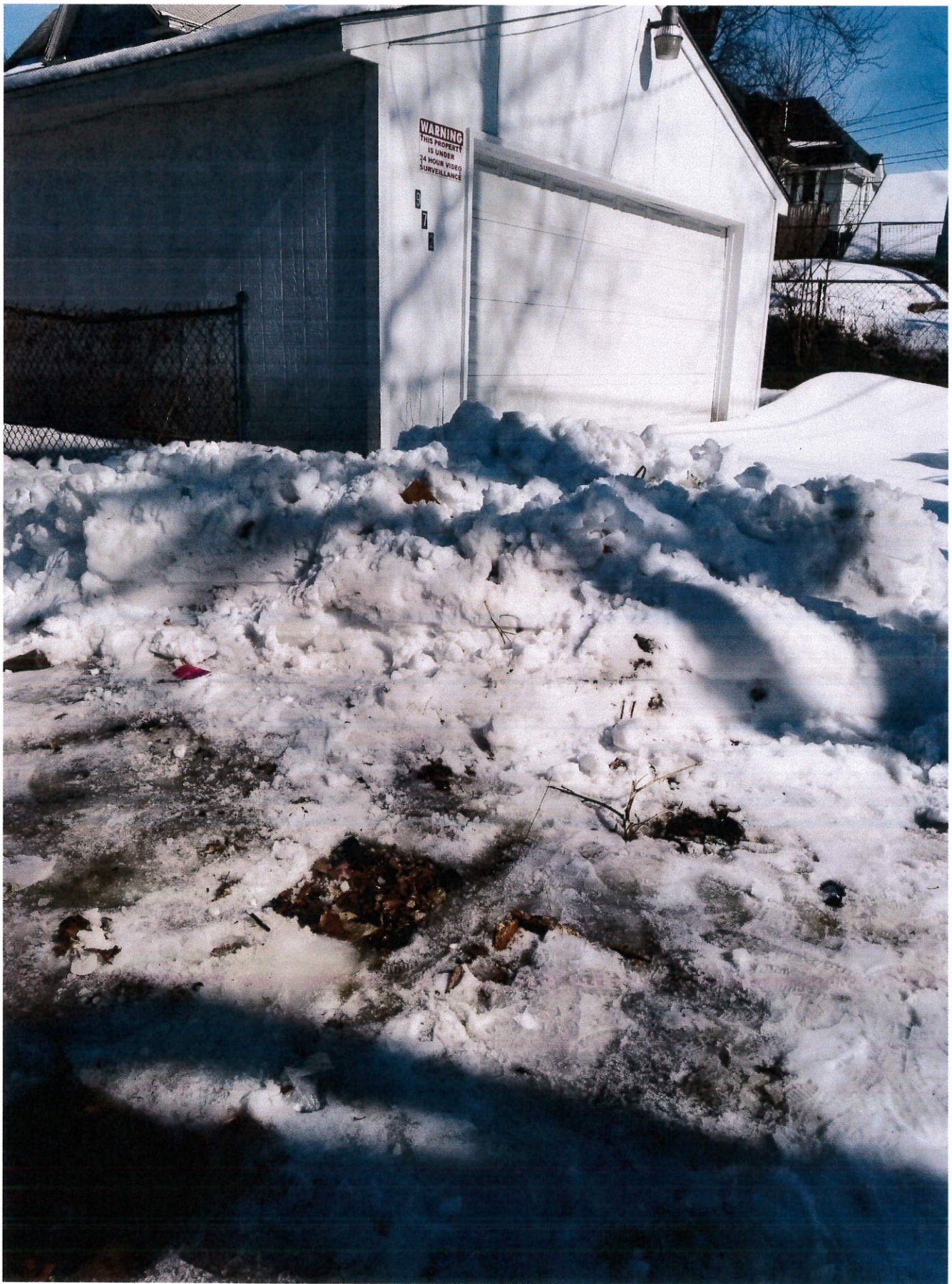
970 Euclid After