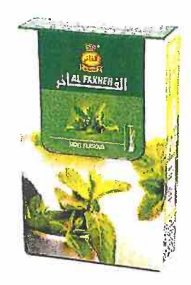
Example: Al Fakher "Mint" shisha Explanation: "Mint" is a flavor allowed by ordinance.

cigar wraps Explanation: "Da Bomb Blueberry" is a fruit flavor. This product is NOT allowed by ordinance.