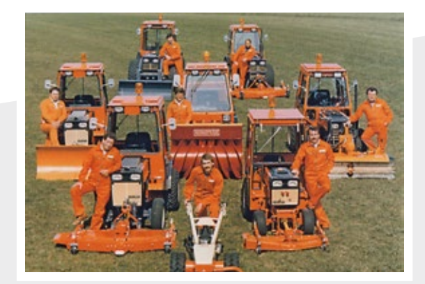
1980: Holder enters the municipal business with a broad product range.

Mechanisation in the local authorities is progressing and Holder responds with his first municipal tractor P 50.