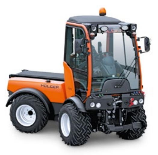
In 2010 the C series sets new standards in versatility, comfort and efficiency.

The Holder A 10 of the year 1954 – a vehicle concept that has retained its validity to the present day.