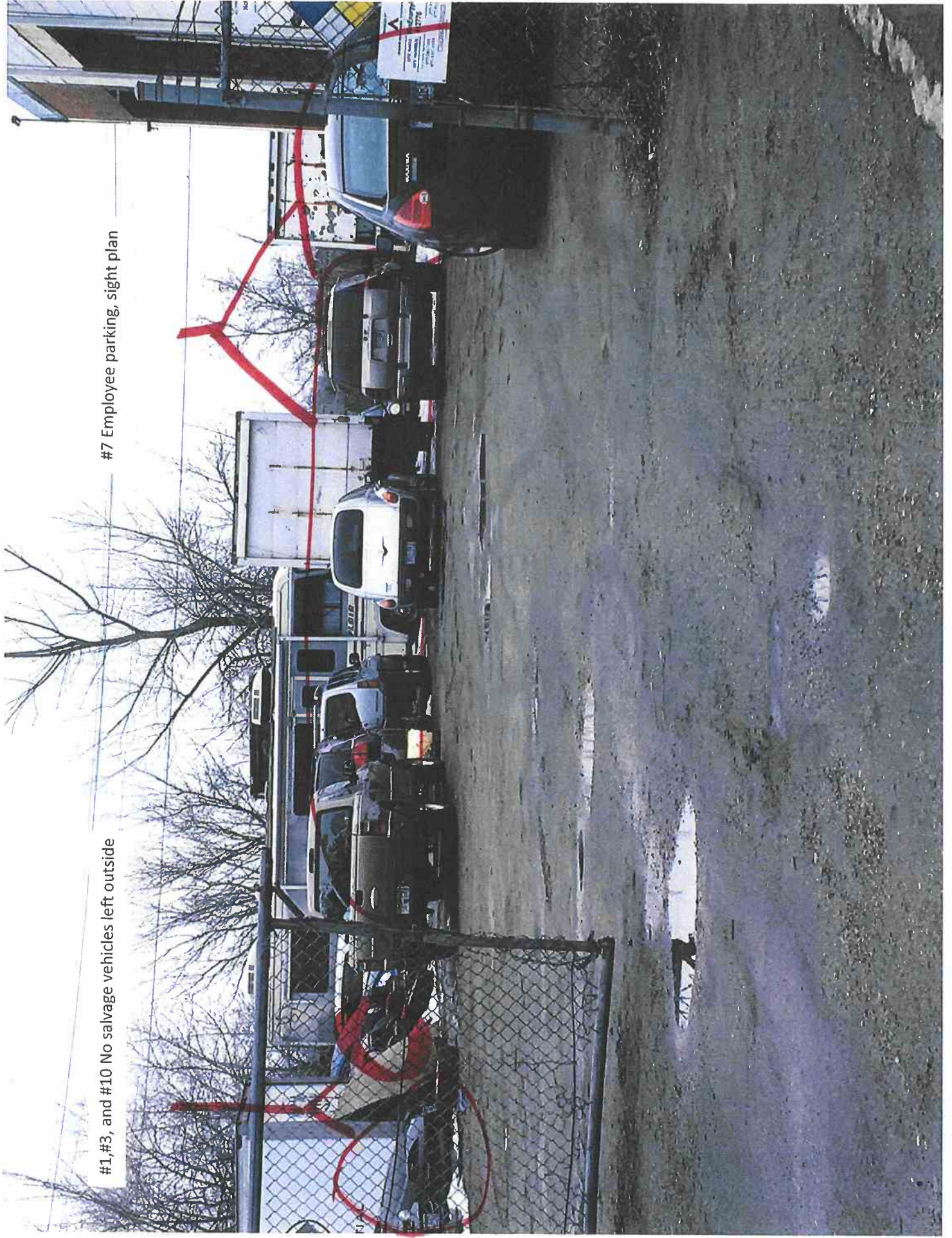
#7 Employee parking, sight plan