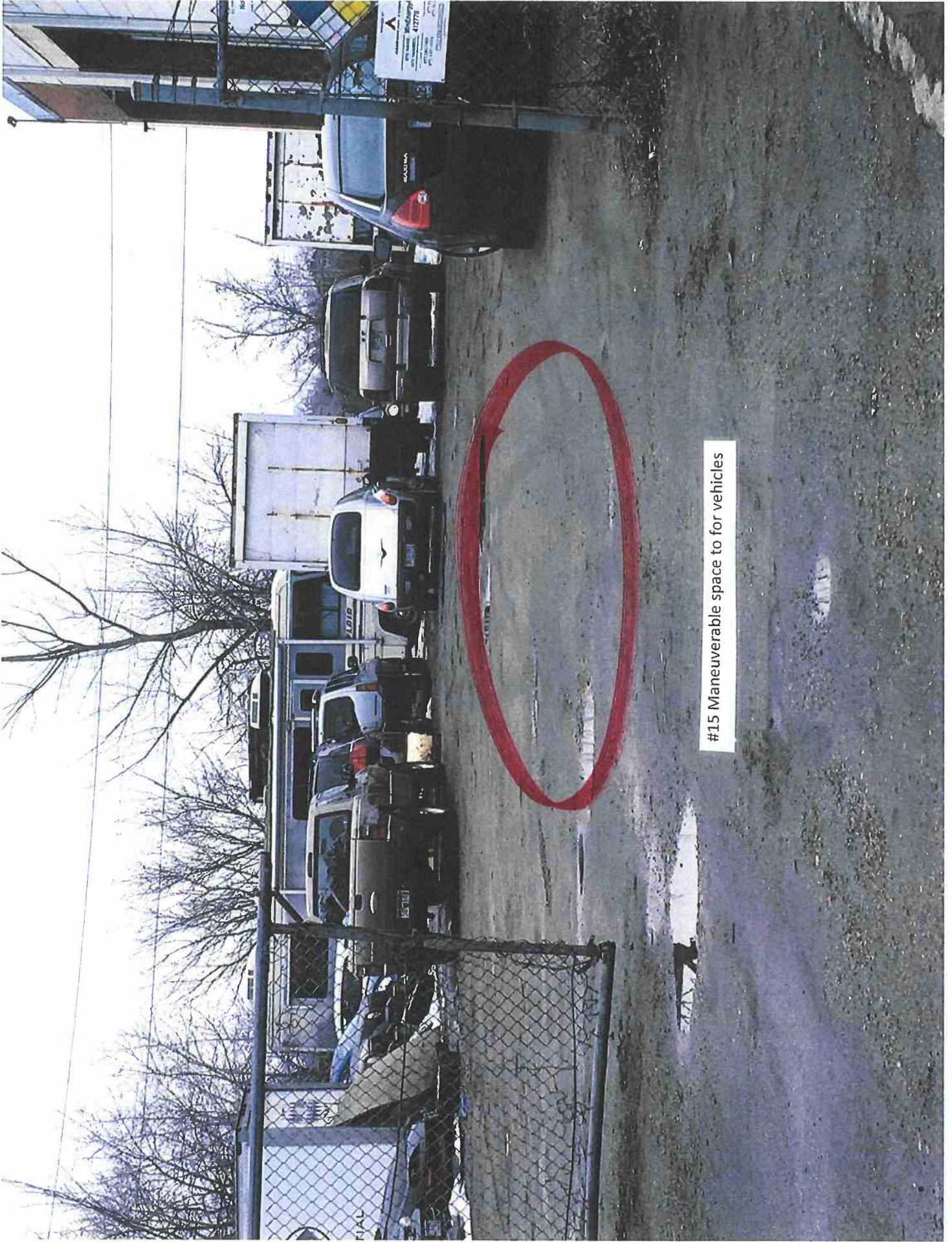
#15 Maneuverable space to for vehicles