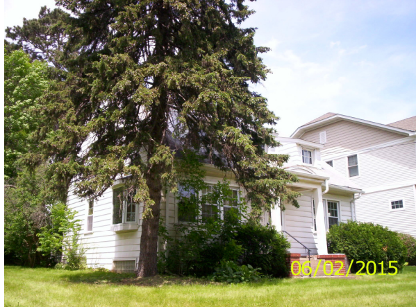
South and east sides