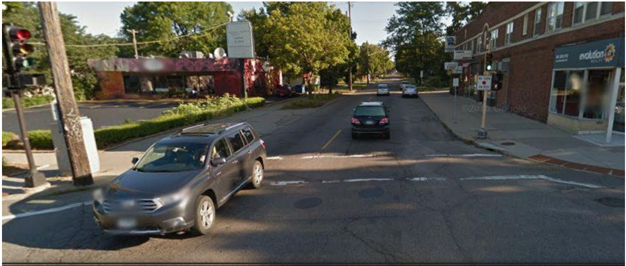
Southbound cars cannot drive around a turning vehicle stopped too close to the crosswalk.

I also strongly suggest widening the southbound Cleveland lane at the Randolph intersection to accommodate both a bike lane and left turn lane to eastbound Randolph. Many times a southbound car is waiting to turn left onto eastbound Randolph for most of the green light because of the unbroken northbound Cleveland Avenue rush-hour traffic. Southbound cars cannot go around a turning car that has not pulled fully into the intersection's center: