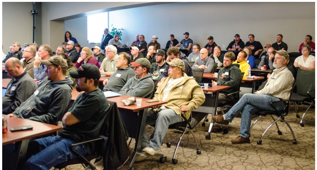
There was standing room only in the breakout session on Visit St. Paul and the History Center. Other sessions included parks and recs and libraries, Habitat for Humanity and Catholic Charities, and financial planning with Voya.