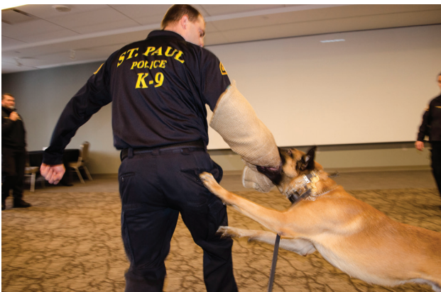
One of the most popular events of the day of was the visit and demonstrations of the St. Paul Police K-9 unit.