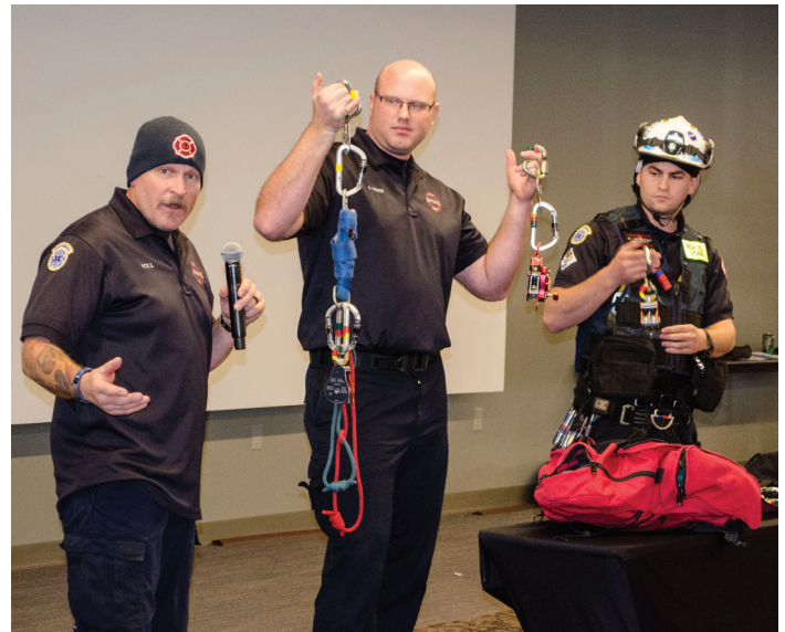
Members of the St. Paul Fire Department show off some of the tools that they use in a confined space rescue. They also touched on trench rescue and home fire safety.