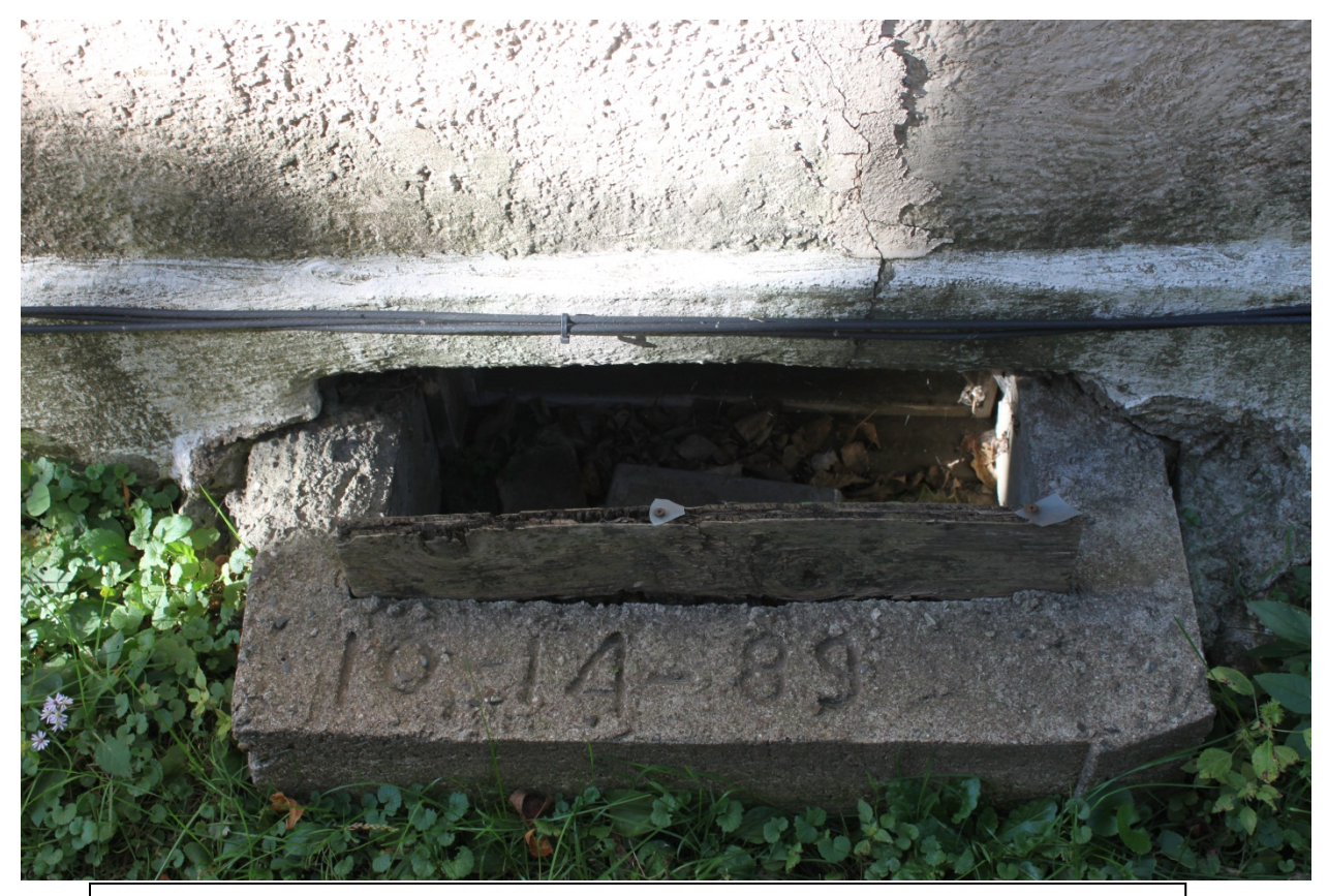
East elevation window well dated October 14, 1889 (above), with west elevation stucco fill (below left) and front door (below right)