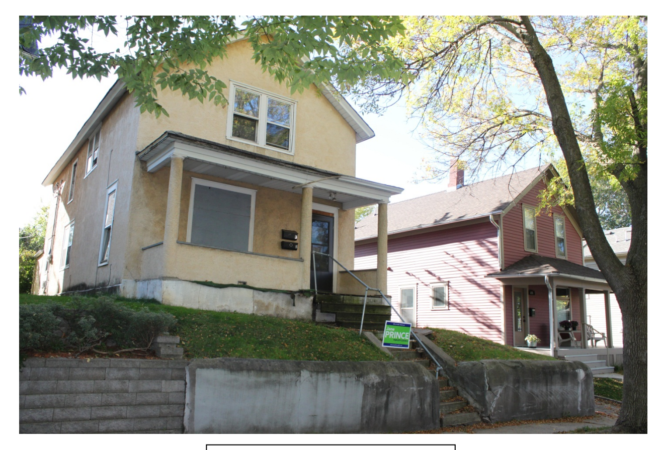
700 4<sup>th</sup> St E northeast elevations