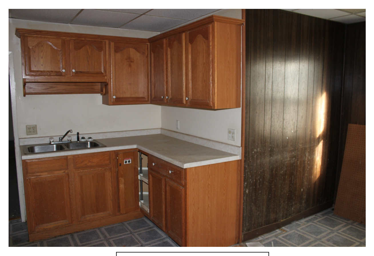
Kitchen (above) and basement (below)