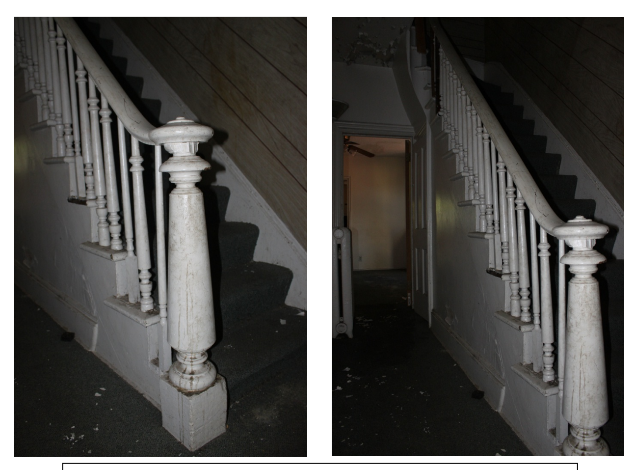
Front stairwell balusters and newel post (above), trim detail in front hall (below left), and east elevation projecting bay window in Dining Room (below right)