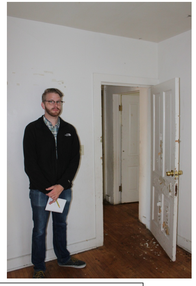
Front door with transom in front hall (above left), scale of 2<sup>nd</sup> floor doorways (above right), 2<sup>nd</sup> floor front bedroom (below)