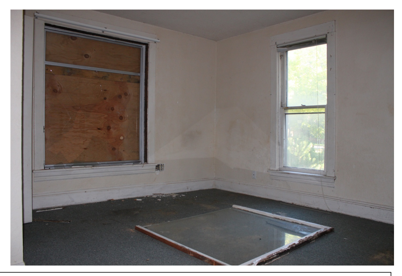
Living Room (above), Eastlake style hinge detailing (below left) and enclosed back porch (below right)