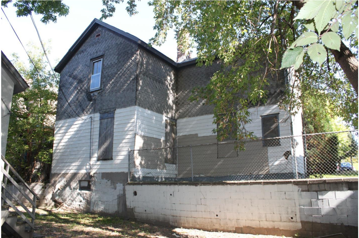
275 Bates Avenue southeast elevation (top), c. 1935 asbestos cement and asphalt shingle exterior walls (below) with exposed original clapboard (below left)