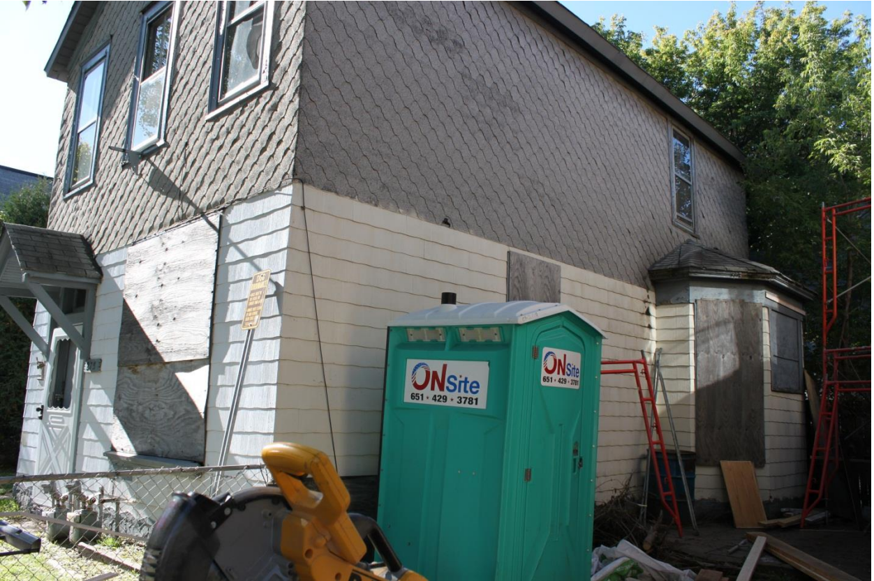
275 Bates Avenue northwest (top) and northeast (bottom) elevations