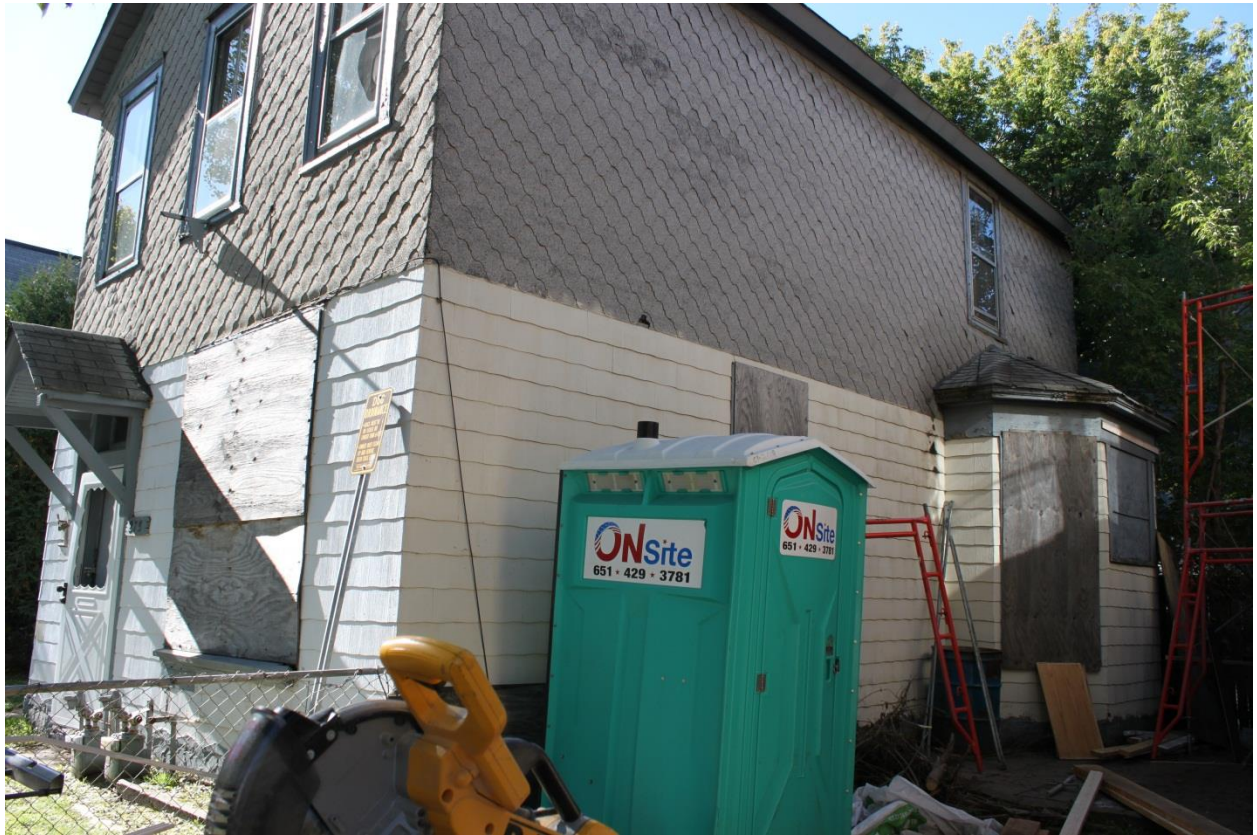
275 Bates Avenue northwest (top) and northeast (bottom) elevations