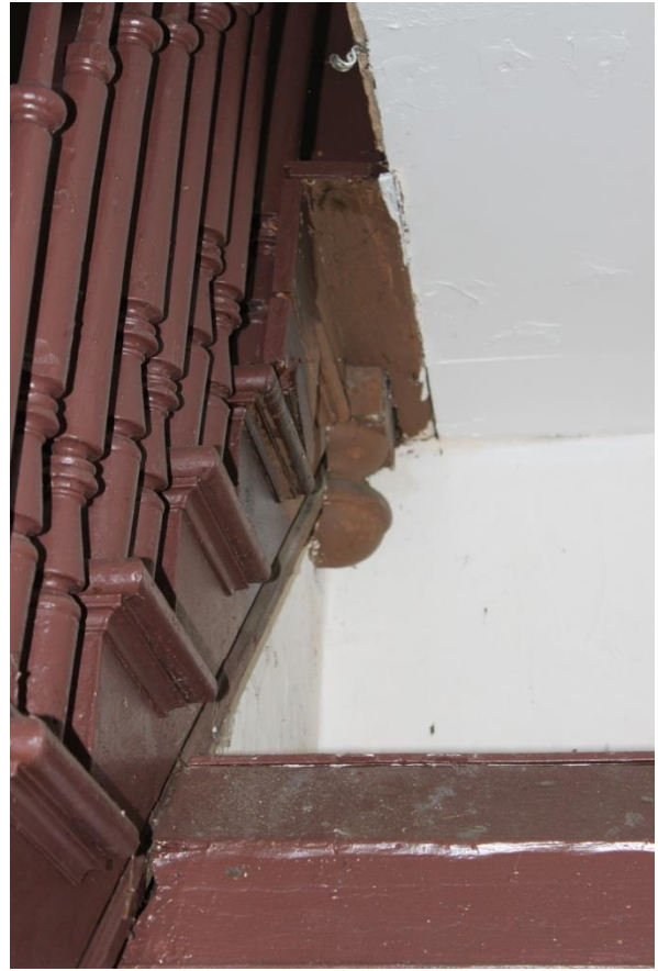
C. 1884 baluster detail in front hall (above), downstairs kitchen (below left) and upstairs kitchen (below right)