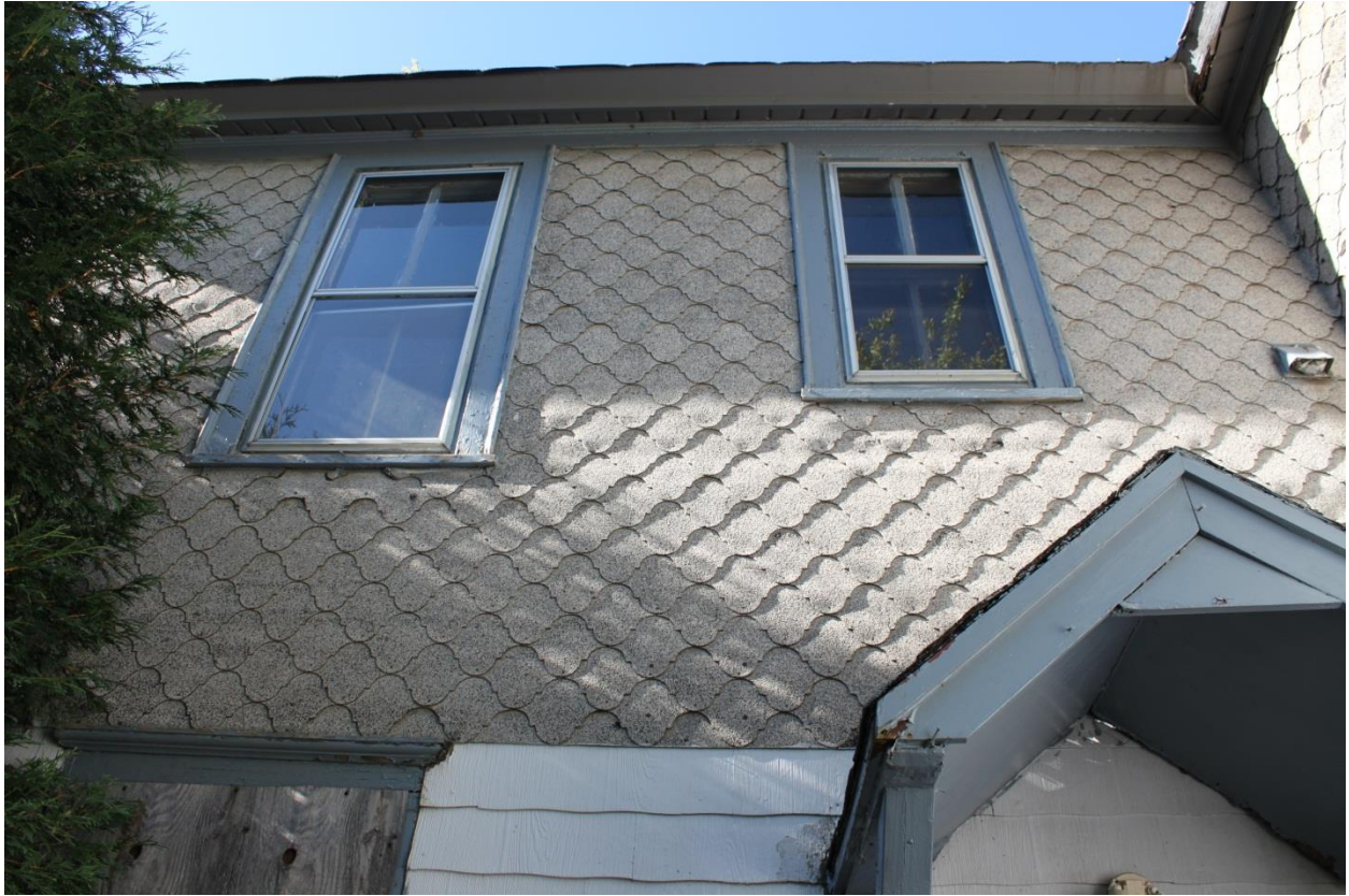
C. 1935 asphalt and asbestos cement shingle detail on north elevation (above), c. 1884 Eastlake style balusters and newel post detail in front hallway (below)