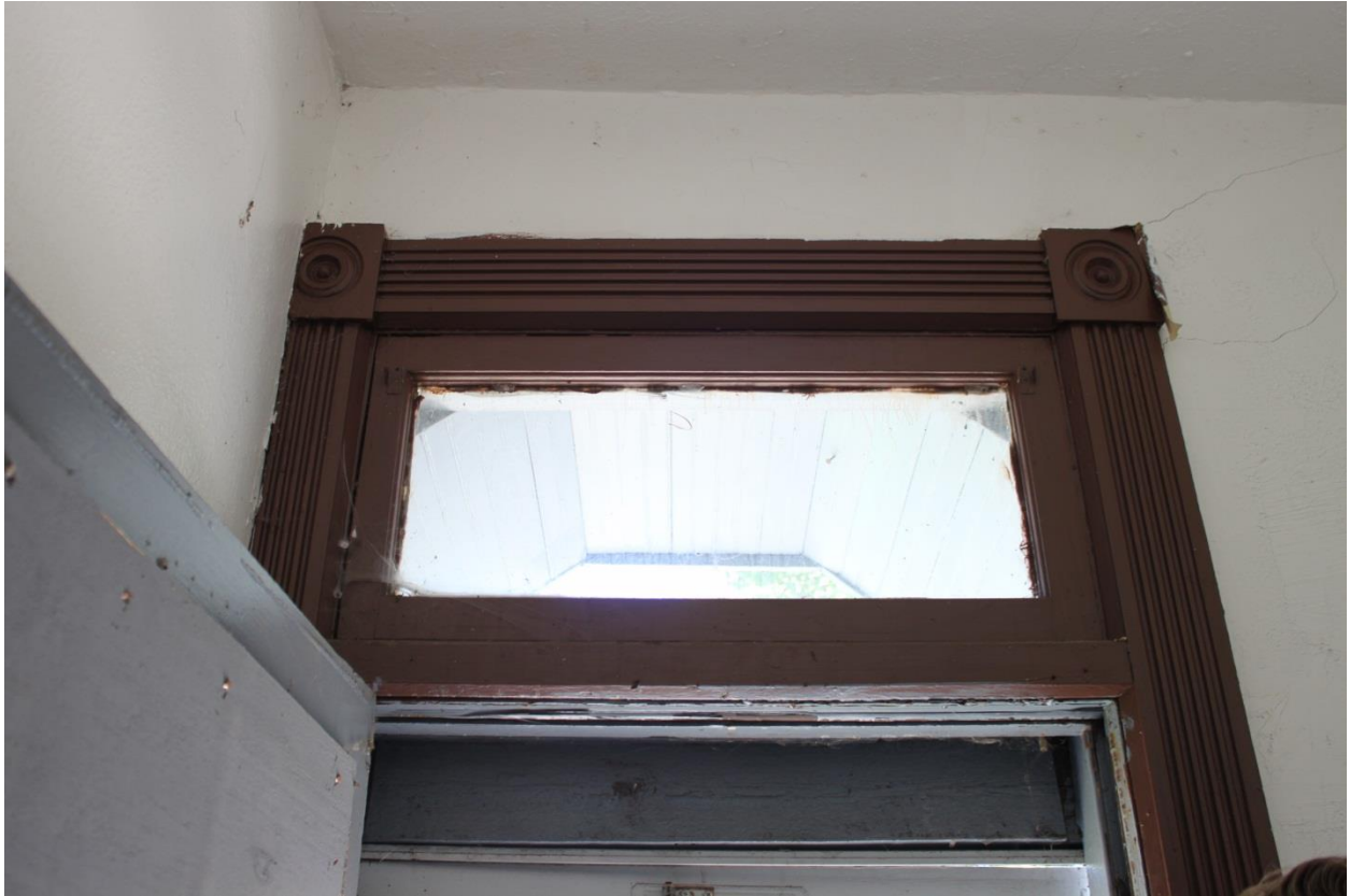
Transom and trim detail of front door in first floor vestibule (above), similar trim detail in upstairs front room (below)