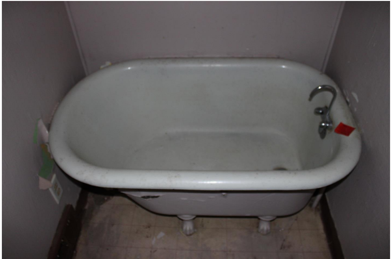
Downstairs bathtub (above) c. 1884 baseboard detail in first floor southwest room (below)