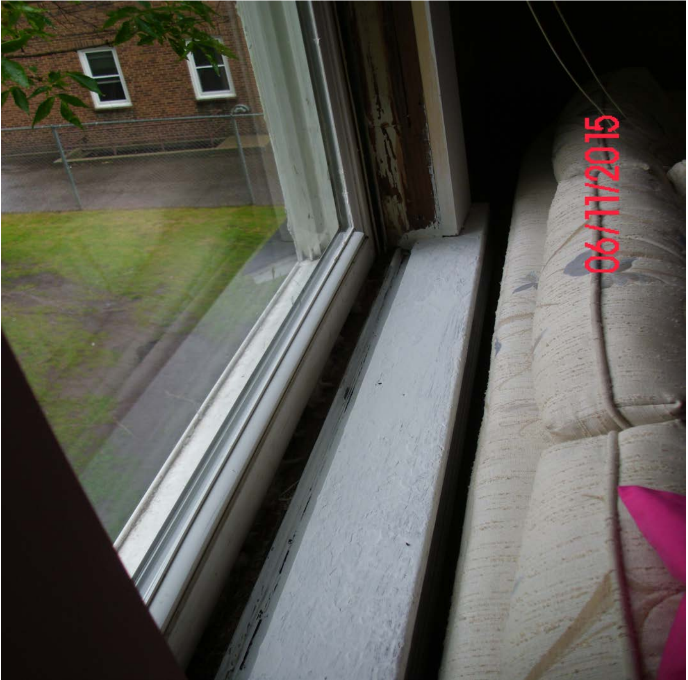
Replacement window not finished. Insulation showing at lower sash/sill

Date: June 12, 2015 File #: 13 - 252825 Folder Name: 1052 ROSS AVE PIN: 282922340015