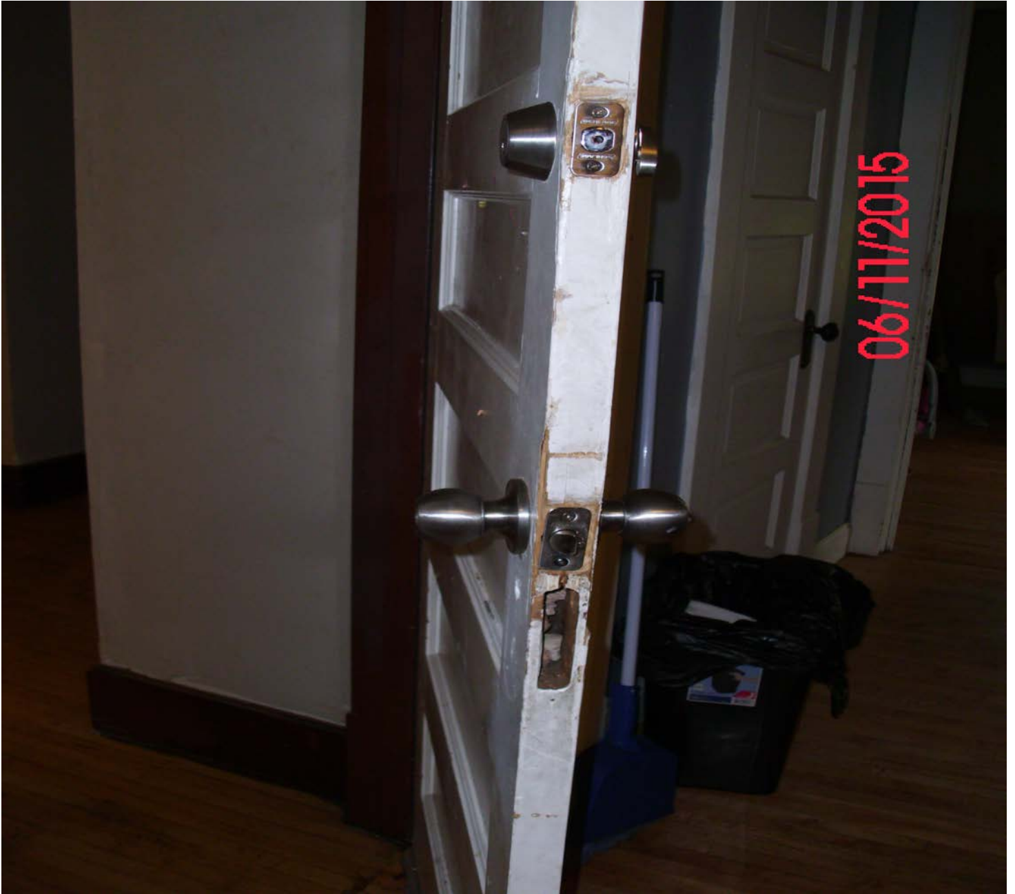
Continuation of first picture

Date: June 12, 2015 File #: 13 - 252825 Folder Name: 1052 ROSS AVE PIN: 282922340015