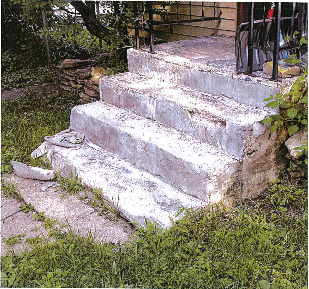
Image - original steps - note the bottom step is basically entirely spalled out: