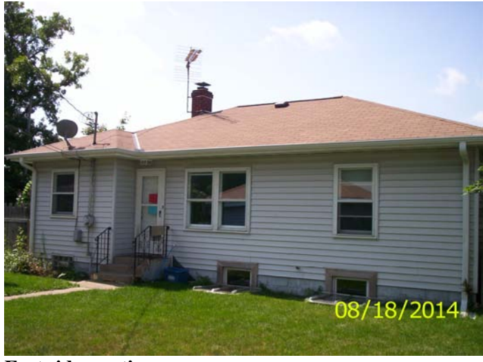
East side, posting