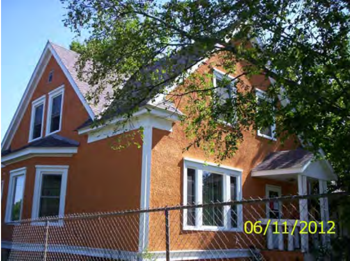
South and west sides, postings

HP District: Property Name: Survey Info: