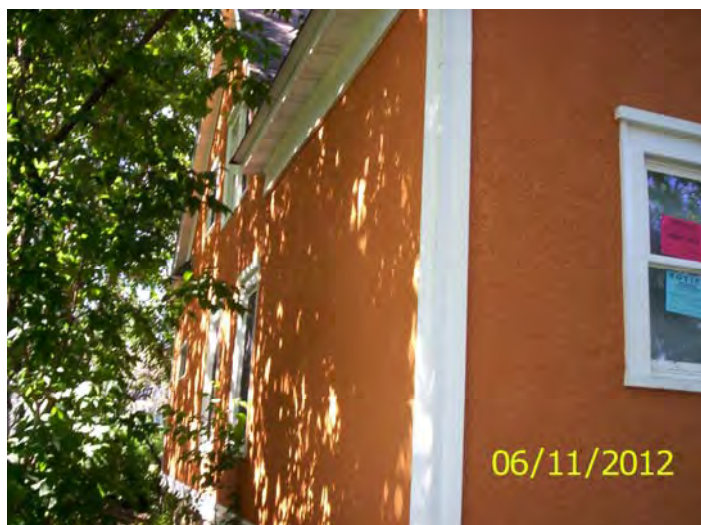
East side, posting