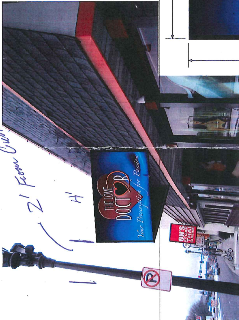
Photo Rendering Overlay