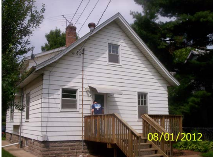
South and east sides