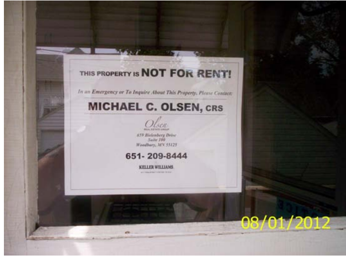
Posting for owner's agent