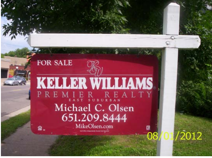
Posting for owner's agent