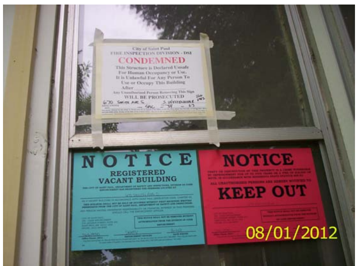
Posting on front of house