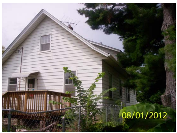
North and east sides, postings