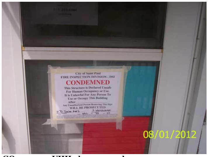
CO program UHH plac on rear door