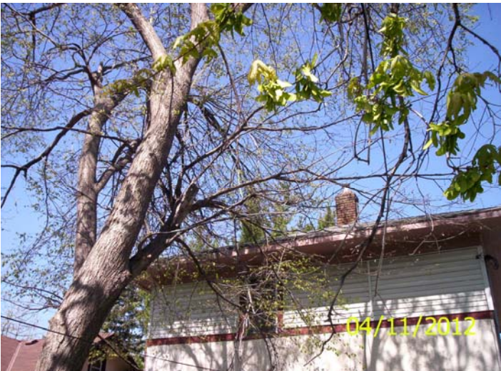
Roof damage from tree