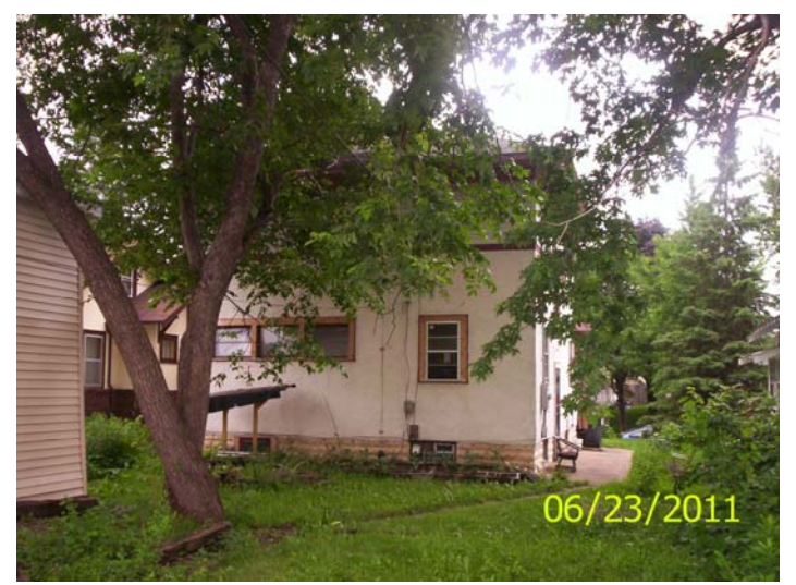
South and east sides