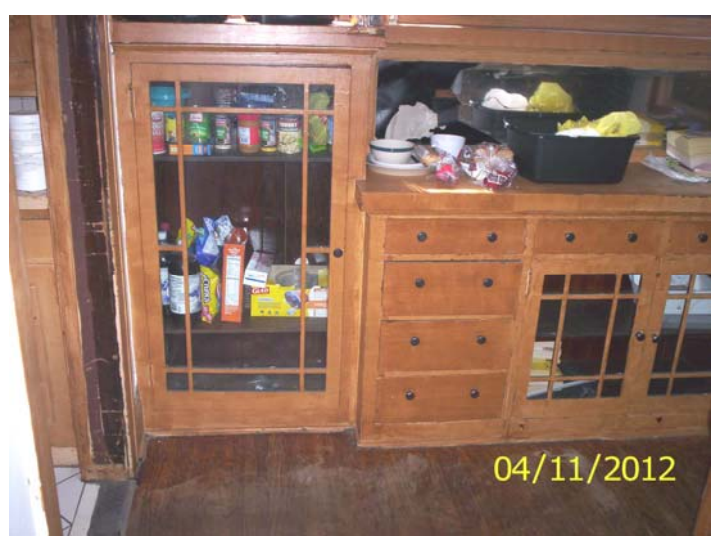
Common area food storage