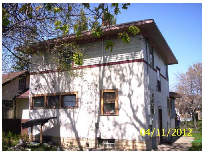
South and east sides