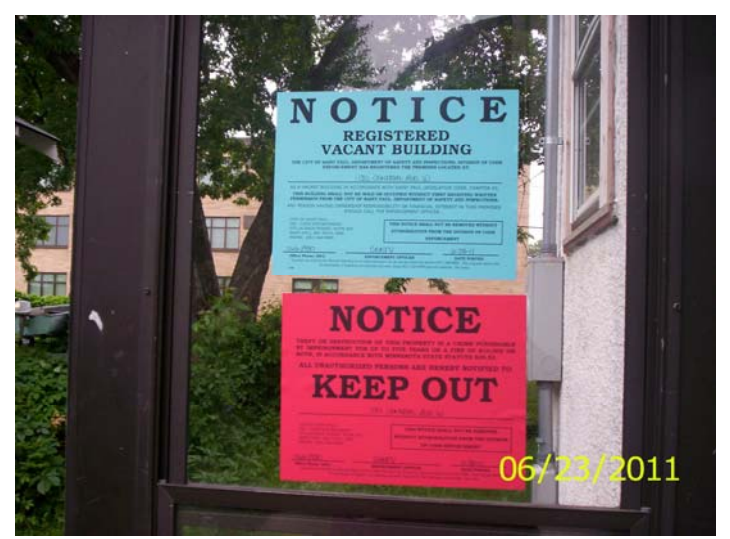
Posting on east side door