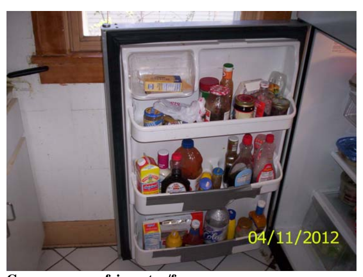
Common use refrigerator/freezer