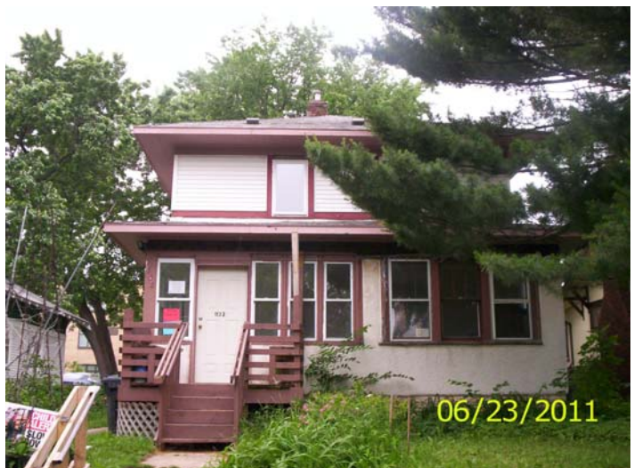
North side, postings