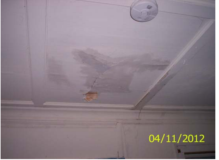
Water damaged ceiling