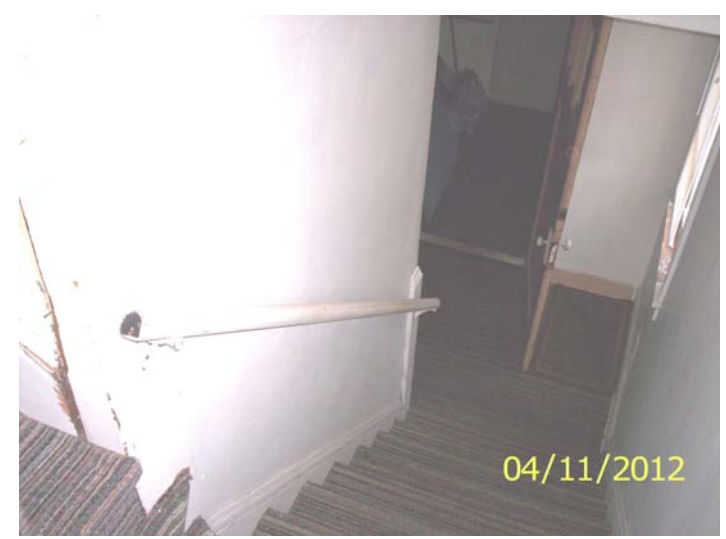
Unapproved hand rail