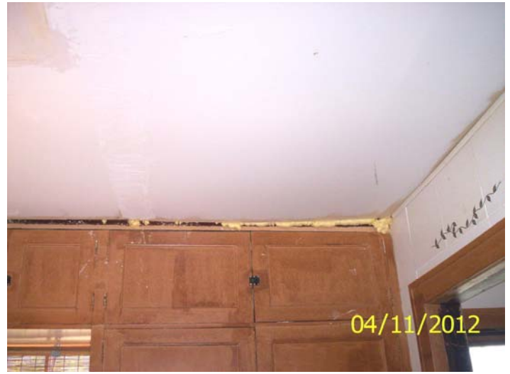
Open kitchen ceiling