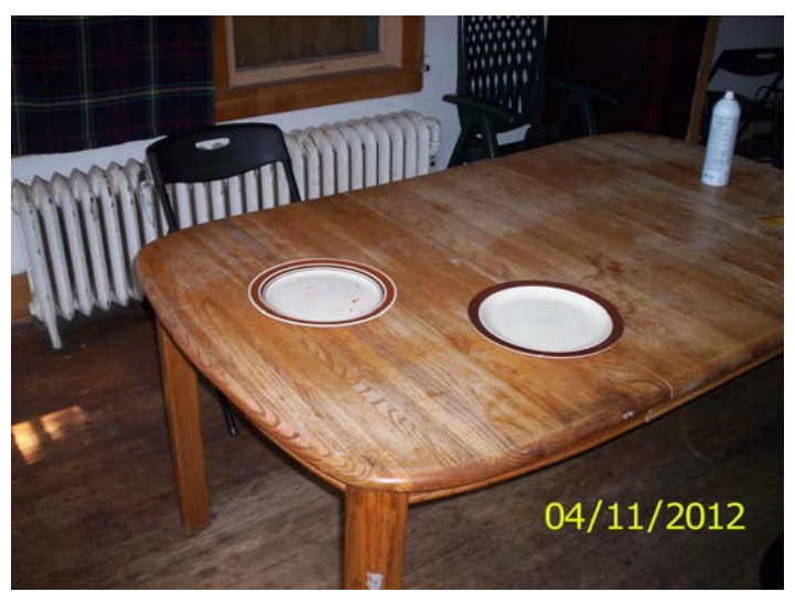
Common dining area