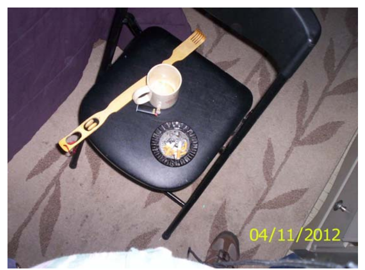
Contents of rented bedroom