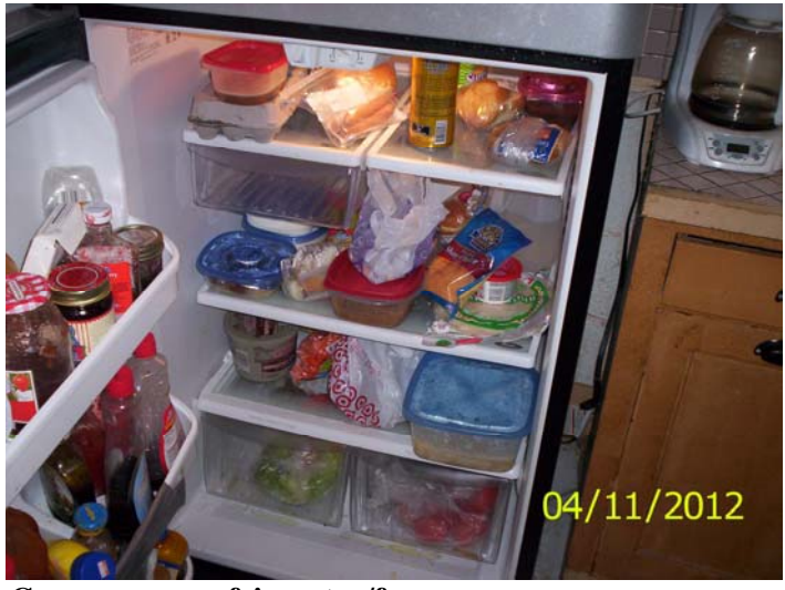
Common use refrigerator/freezer