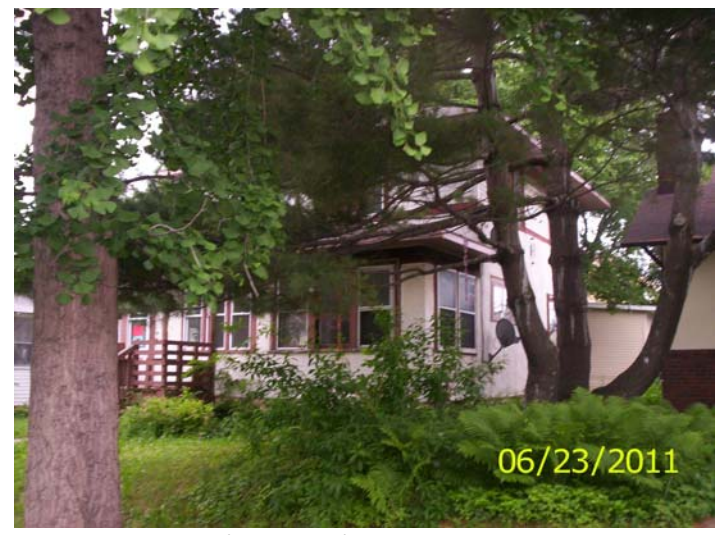
North and west sides, posting

HP District: Property Name: 1132 CENTRAL AVE W Survey Info: 342923410028