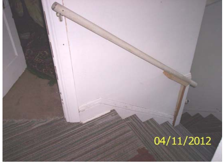
Unapproved hand rail