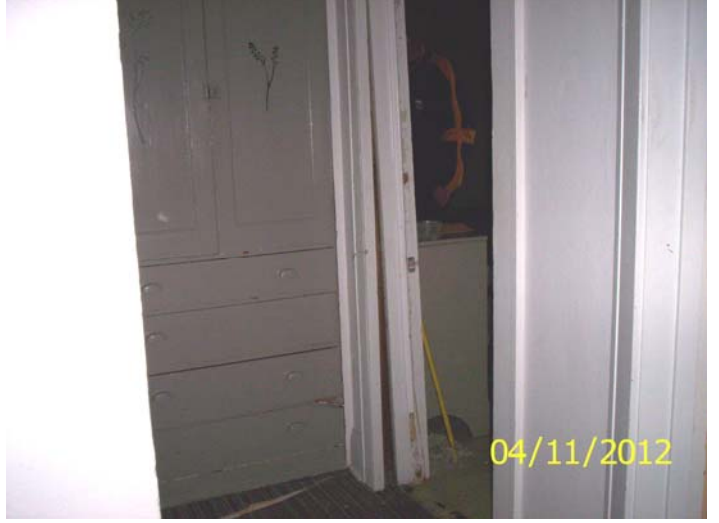
Damaged door frame