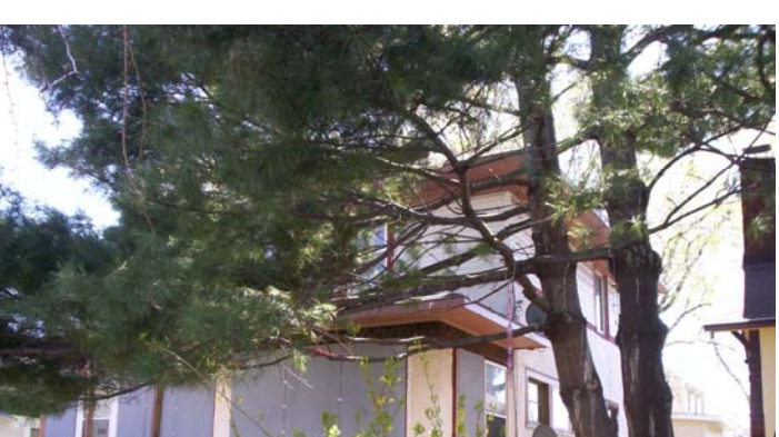
North and west sides