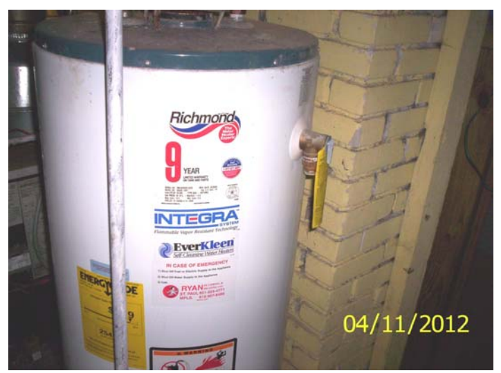
Water heater missing overflow tube