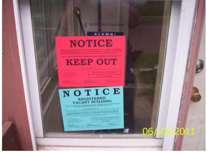
VB/KO plac's posted on front of house