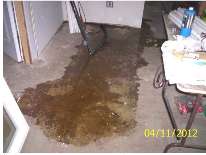
Standing water on the basement floor