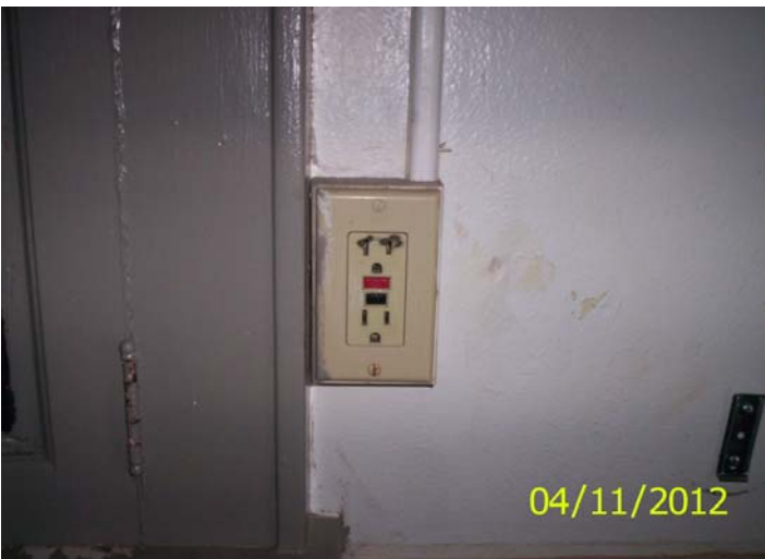
Fire damaged electrical outlet in common bathroom