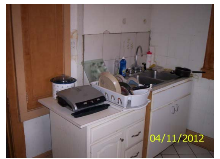
Common kitchen area