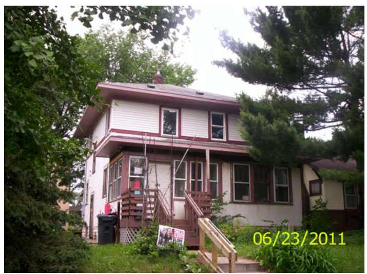
North and east sides, postings