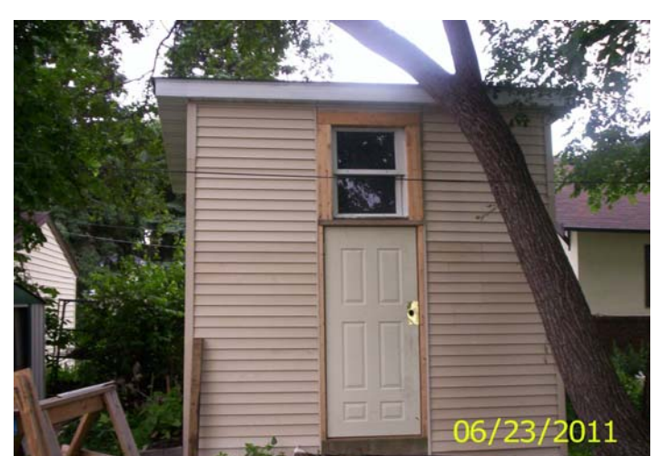
Wood frame shed