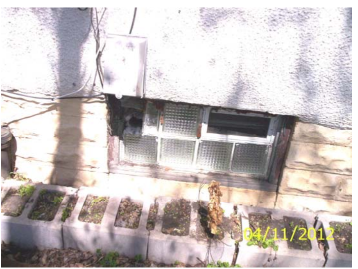
Damaged, open dry vent