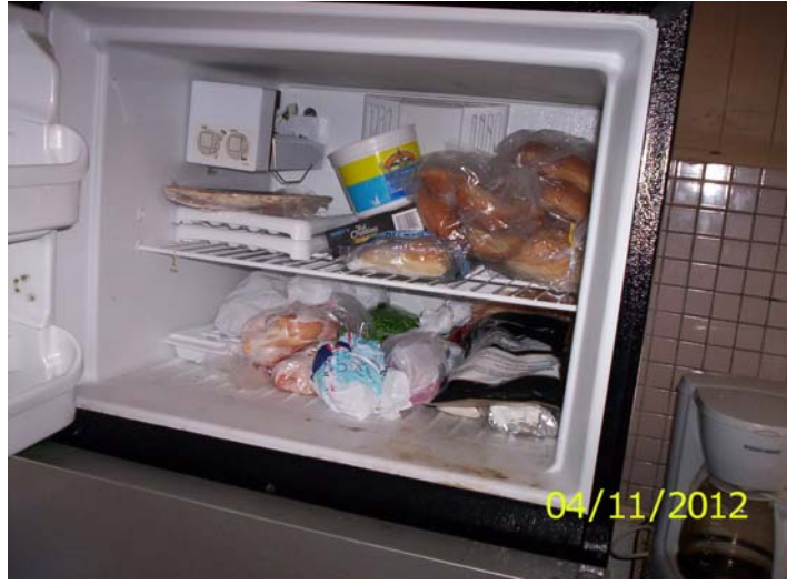
Common use refrigerator/freezer