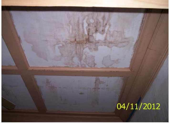
Water damaged ceiling