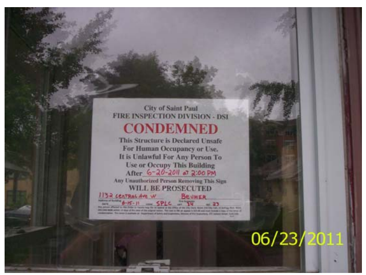
CO UHH posting on front of house