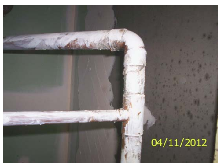
Upper pipe joint leaking, mold on wall