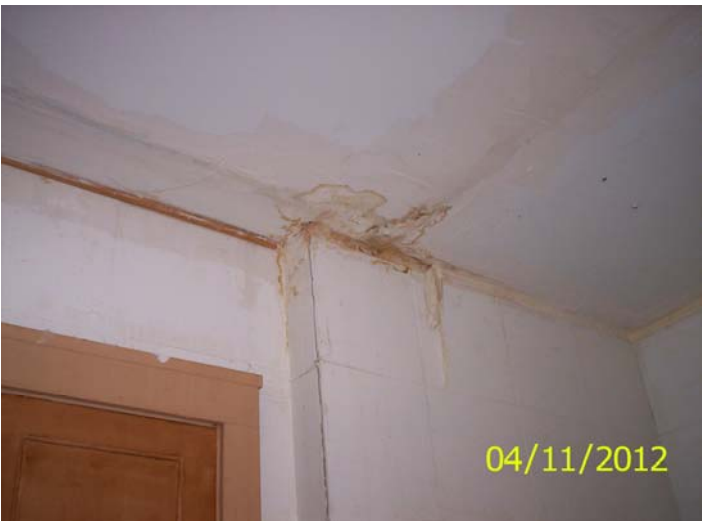
Water damaged ceiling and wall