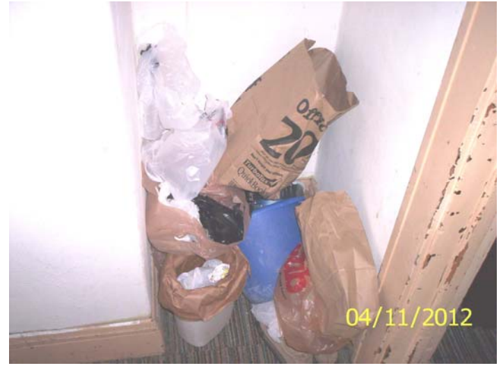
Refuse and debris