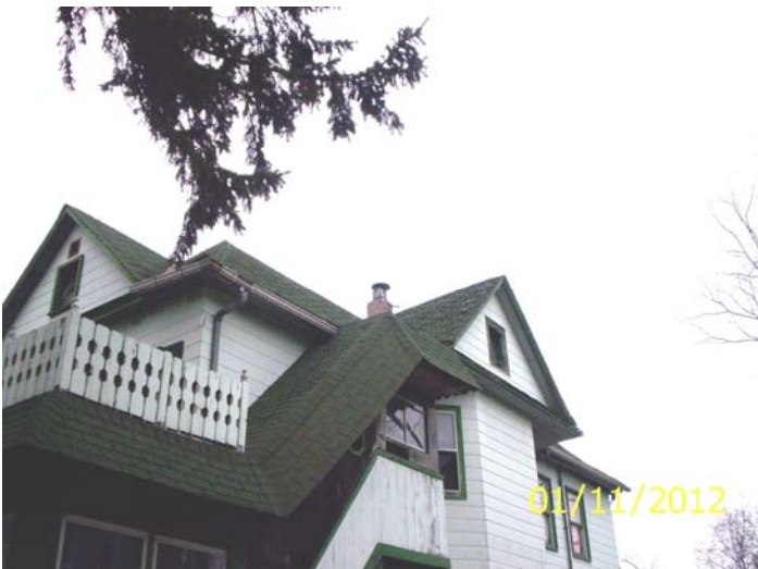
Deteriorated roof covering