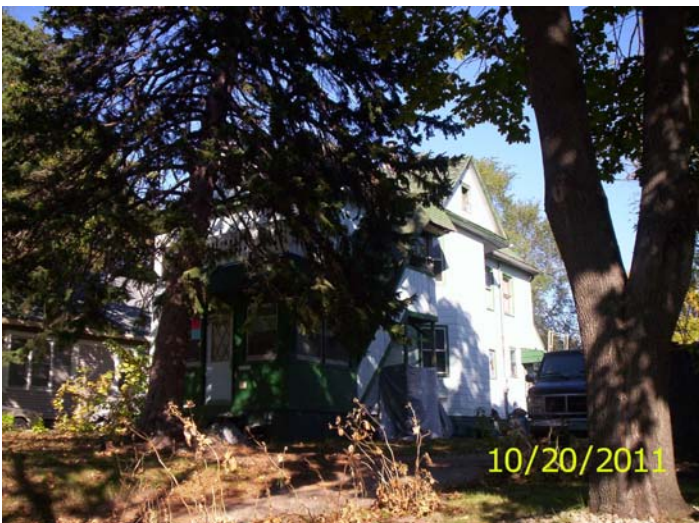
South and east sides