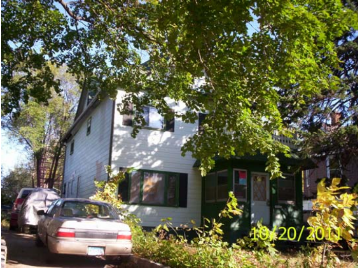
South and west sides, posting

HP District: Property Name: Survey Info: