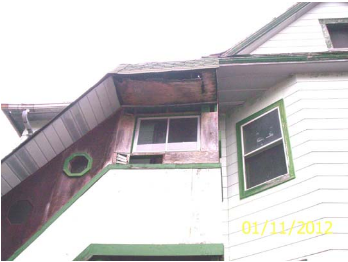
Rot damaged, open eave and wall

HP District: Property Name: Survey Info: