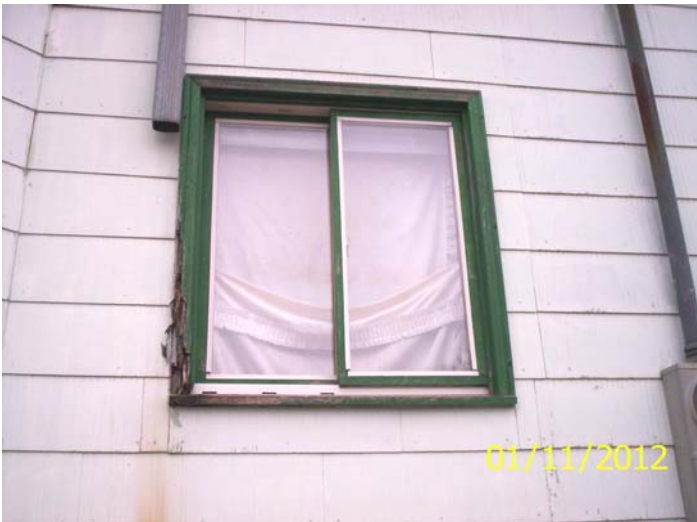
Rot damaged window, rain leader drains onto window