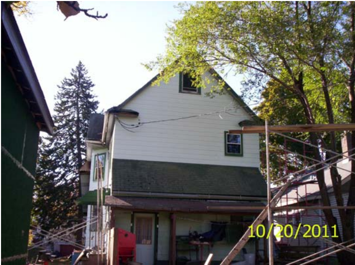
North and east sides

HP District: Property Name: Survey Info: