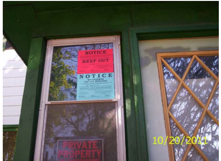
Front (south side) posting