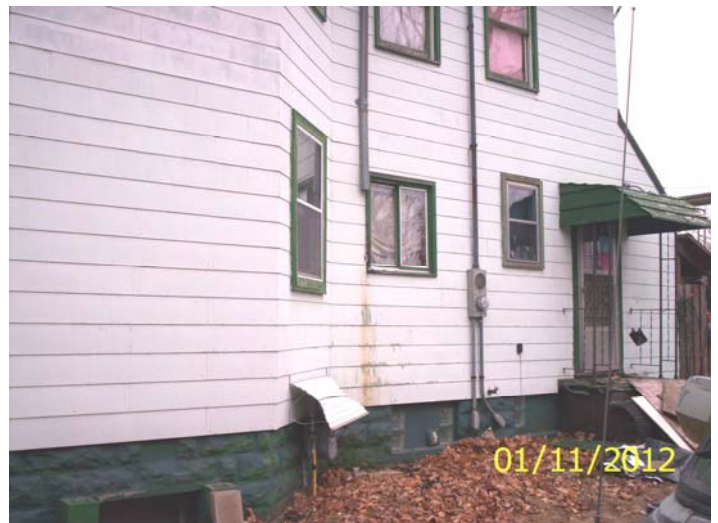
Rain leader drains over wall and at foundation