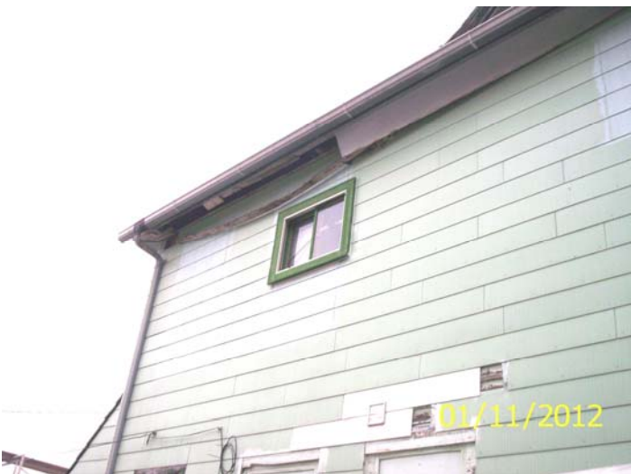
Rot damaged eave, missing siding