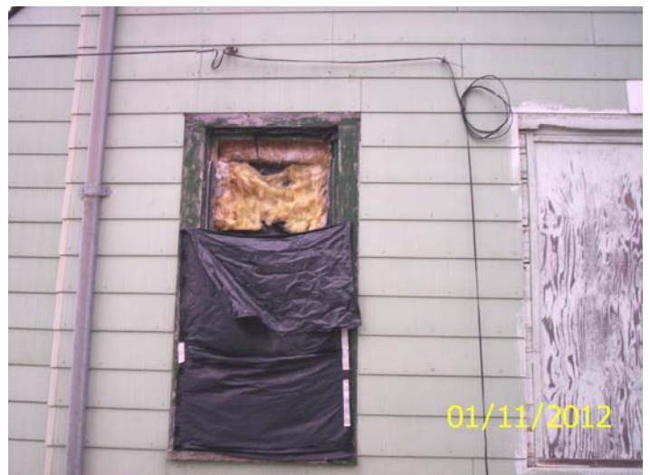
Improperly abandoned window, open wall, chipped/peeling paint