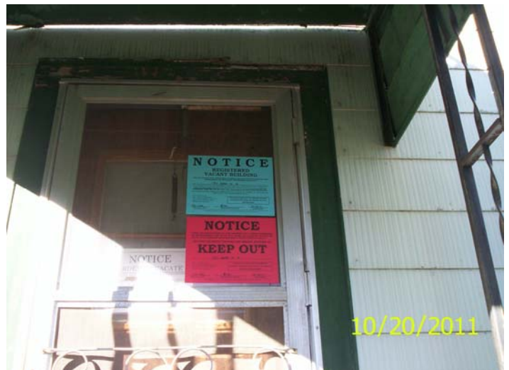
East side posting