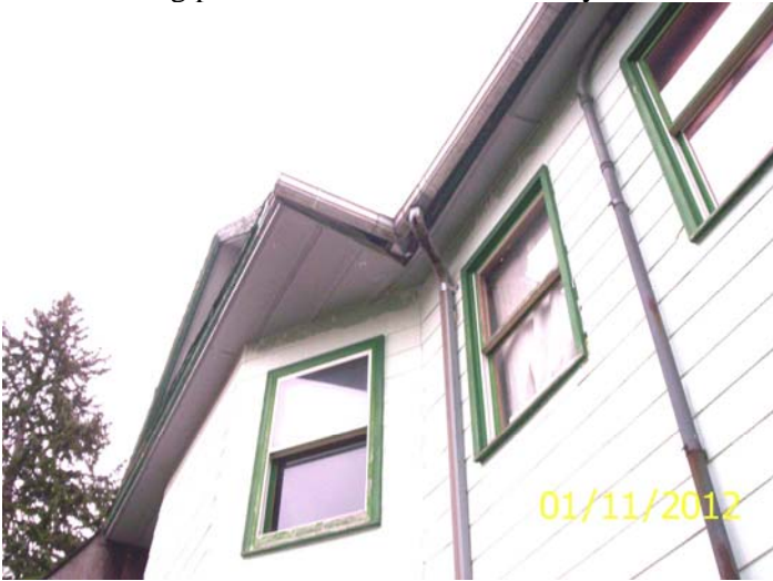
Rot damaged, open eave

The following pictures were taken on January 11, 2012