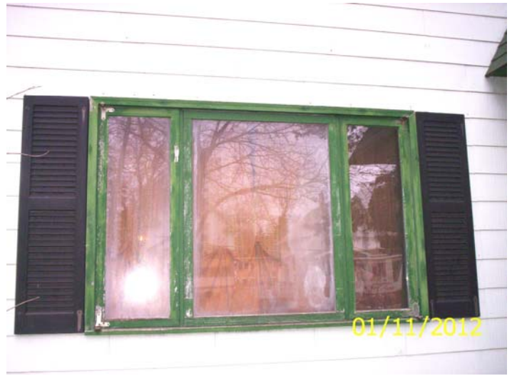
Rot damaged window, water staining on interior side of window