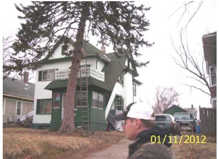
South and east sides